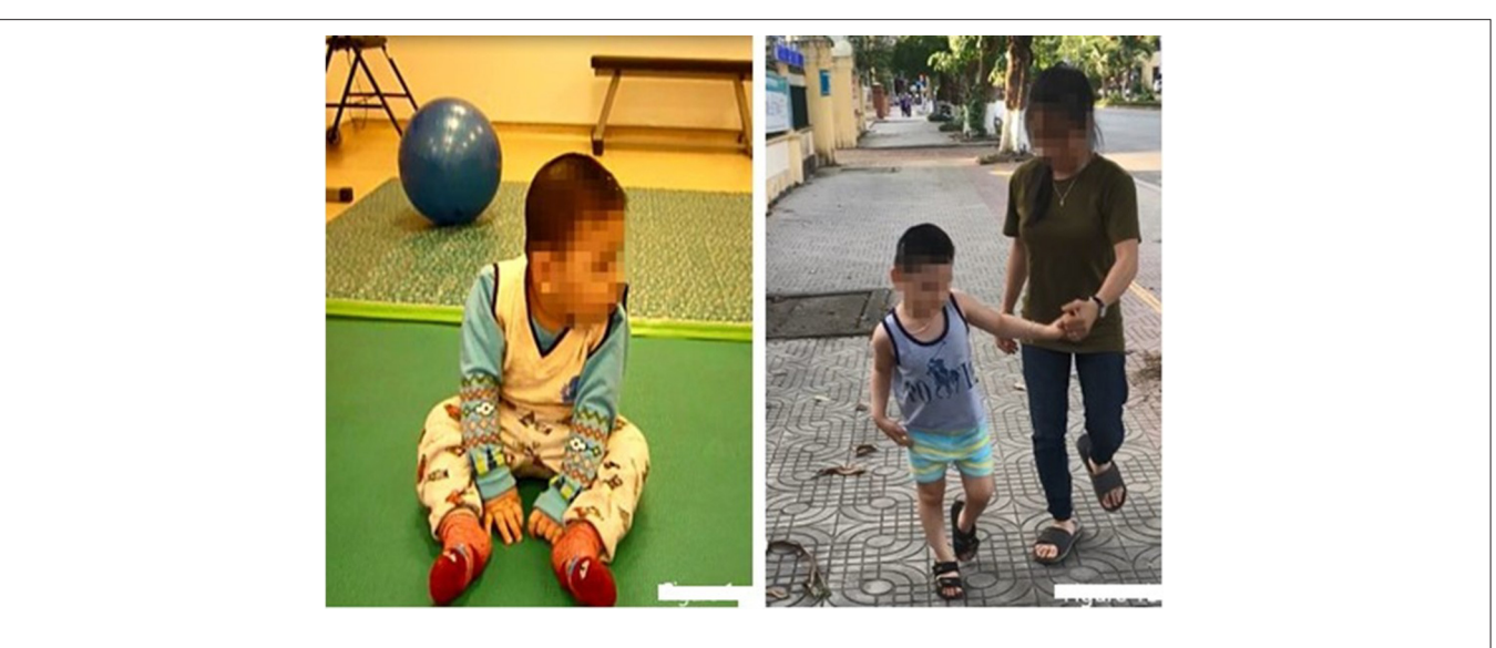
FIGURE 1 | The improvement of motor functions and muscle tone in Case 1 before and after stem cell transplantation.

TABLE 1 | Details in BMNMCs transplantations.