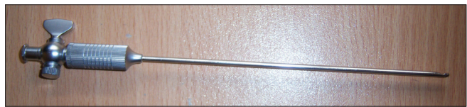
Figure 2: Veress needle

which is used primarily to achieve pneumoperitoneum during laparoscopic surgery. It is also useful in laparoscopic port closure as well as ovarian cyst drainage. The veress needle is autoclavable and will be a cheaper alternative to standard disposable aspiration/drainage devices. Certainly, under ultrasound guidance the needle can be passed into the cavity without the need for laparoscopy. It will also be more effective than the use of intravenous cannula (which has been described in our region) [3] because of its bigger caliber and its longer length.