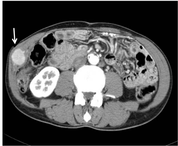
Figure 2. Needle-track seeding (arrow) without skin involvement on a CT scan.