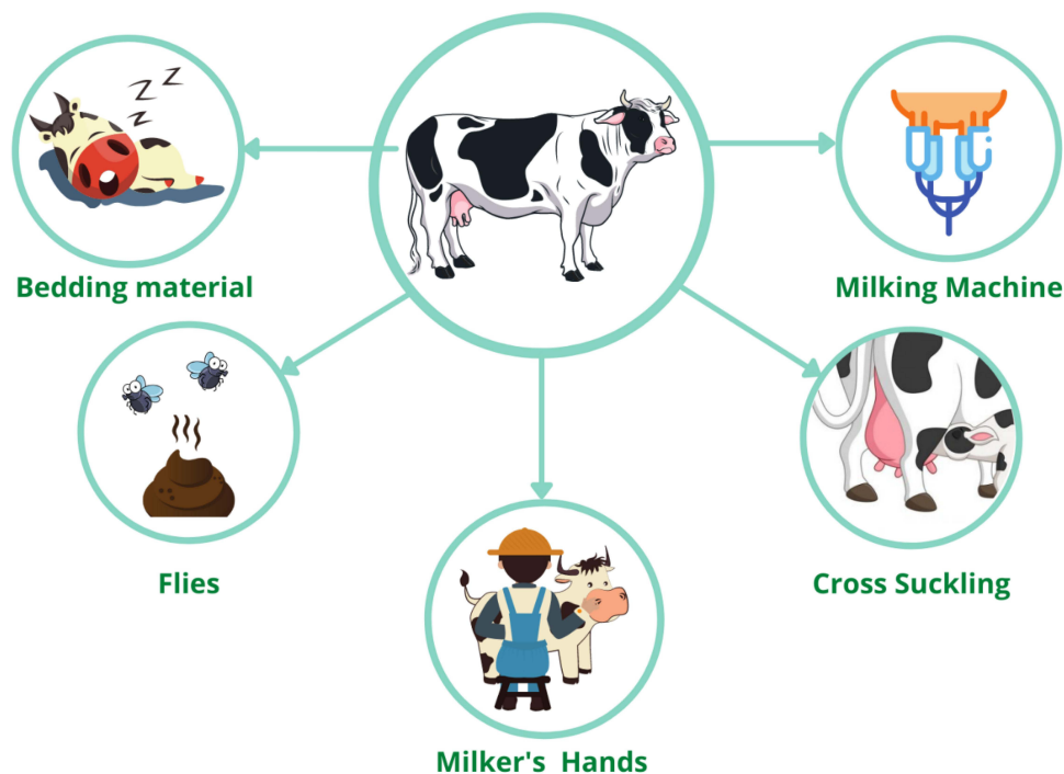
Figure 1 Various sources of micro-organisms causing bovine mastitis.

The most common pathogens found in mastitis could be identified in the mammary gland or the environment, including excrement, surface of the soil (Figure 1). Infectious and environmental infections are the most common causes of mastitis. S. aureus and S. agalactiae are the most prevalent infectious pathogens. During the milking process, they transmit from infected to clean udders via contaminated milker's hands and cloth towels used to wash or dry udders from many animals, as well as flies. Streptococcus is the most frequent bacterium found in environmental infections ( S. uberis , S. dysgalactiae ) and coliforms like E. coli and Klebsiella . In between the milking, environmental infections are considered to be transmitted. Coliform infections are often linked to an unclean environment, whereas Klebsiella can be found in sawdust containing bark or dirt. Symptoms of coliform infections include abnormal milk, swelling udders, watery milk, and a loss of appetite. Minor pathogens or commensals are microorganisms that colonize the mammary gland, such as Corynebacterium bovis or coagulase-negative Staphylococci (CNS). Bacteria that are common residents of the teat canal and can be identified from milk samples, but have limited clinical importance and seldom induce inflammation, are classified as minor pathogens. Minor infections produce a lower rise in the mean SCC of milk. Clinical cases are frequently caused by microorganisms found in the environment. 20