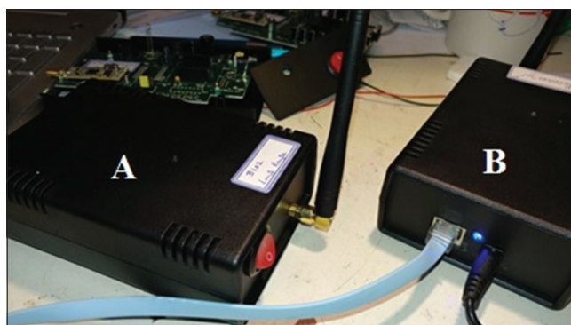
Figure 3: (A) Reader, (B) receiver

Several studies have been conducted on various applications of RFID, [15] that some of them are health related. [16,17]