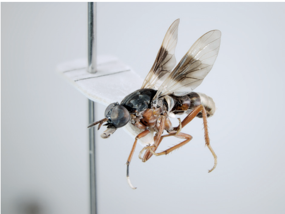
Figure 26. Pipinnipons fascipennis (Kröber), male, anterolateral view [576262]. Body length = 7.0 mm.