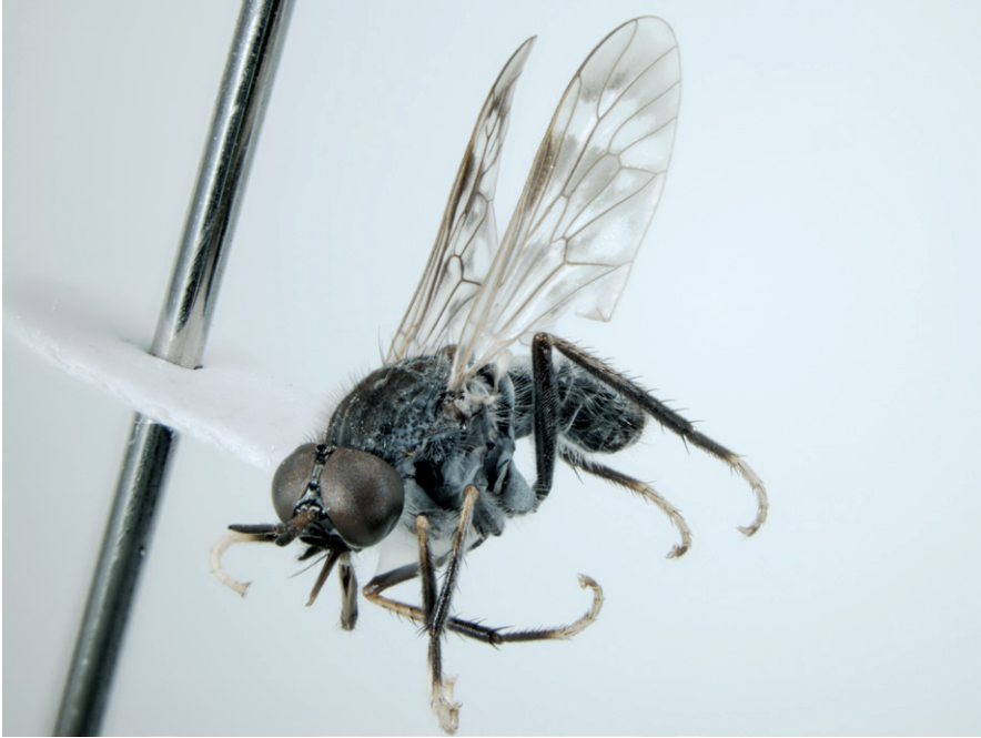
Figure 22. Acupalpa yanchev sp. n., male, anterolateral view [576260]. Body length = 6.0 mm.

tively short; palpus brown-black, acuminate; occiput overlain with sparse, silver-grey pubescence; antennal base raised; antenna longer than head; scape brown, length approximately equal to flagellum, scape with sparse black setae; flagellum black, base of flagellum with short, dark setae. Thorax . Scutum dark, overlain with pubescence of irregular brown to grey markings with pale broken lines and spots, setal bases glossy black; scutellum overlain with grey and matte black pubescence; pleuron dark, overlain with silver-grey pubescence; wing markings irregularly banded to apparently fenestrate; haltere knob white; coxae black, overlain with silver pubescence; femora brown to black; tibia black, yellow-orange dorsal stripe in basal 1/2; tarsi white, basitarsi dark in basal 3/4. Scutal chaetotaxy: np , 3–5; sa , 1 [rarely 2–3]; pa , 1; dc , 2–3; sc , 1. Abdomen . Black (segments 6–8 orange in some females), silver velutum dorsally on tergites (male) or absent (female); terminalia pale.