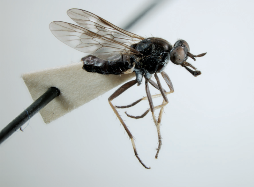
Figure 6. Acupalpa boharti sp. n., female, lateral view [576266]. Body length = 5.0 mm.