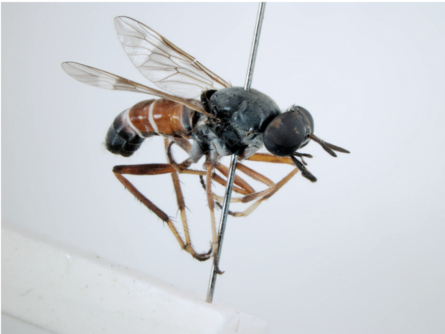
Figure 9. Acupalpa glossa sp. n., male, anterolateral view [576249]. Body length = 8.0 mm.

Description. Body length= 7.0–9.0 mm. Head. Frons wider than ocellar tubercle, profile rounded above antenna, glabrous, sometimes with silver patches of pubescence along eye margin, frontal vestiture as minute setae, surface texture smooth; face broad-