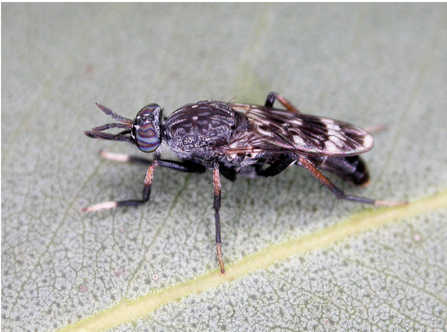
Figure 2. Acupalpa yankep sp. n., female, Yankep, Western Australia. Body length= 9.0 mm.