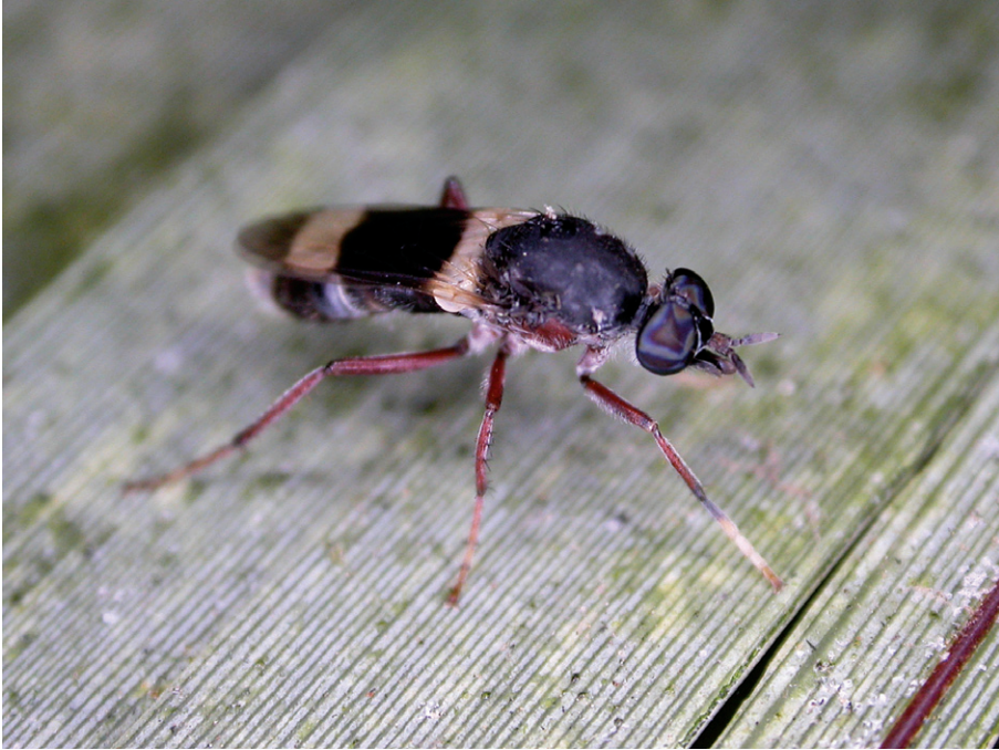
Figure 23. Pipinnipons fascipennis (Kröber), male. Body length = 6.0 mm.