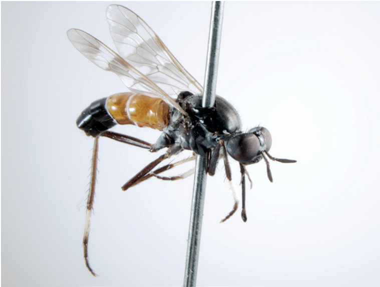
Figure 8. Acupalpa dolichorhyncha sp. n., male, anterolateral view [576248]. Body length = 8.0 mm.

115.533°] (MEI029507) (ANIC). Paratype. AUSTRALIA: Western Australia: female, same data as holotype (MEI029506) (ANIC).