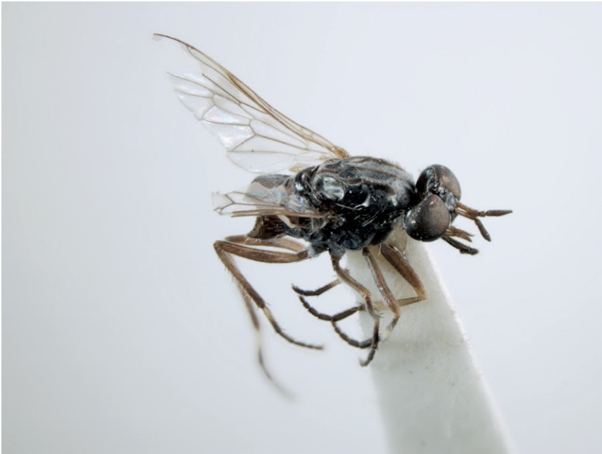
Figure 13. Acupalpa miaboolya sp. n., male, anterolateral view [576253]. Body length = 5.0 mm.

thews. (MEI080305) (ANIC). Paratype. AUSTRALIA: Western Australia: female, same data as holotype (MEI080301) (MCZ).