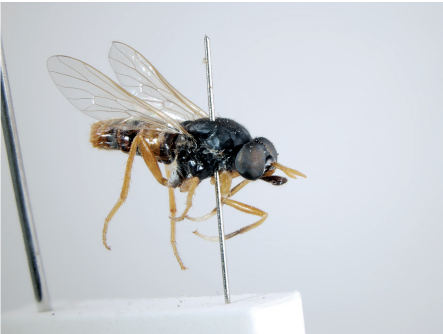
Figure 28. Pipinnipons kroeberi Winterton, male, anterolateral view [576264]. Body length = 8.0 mm.