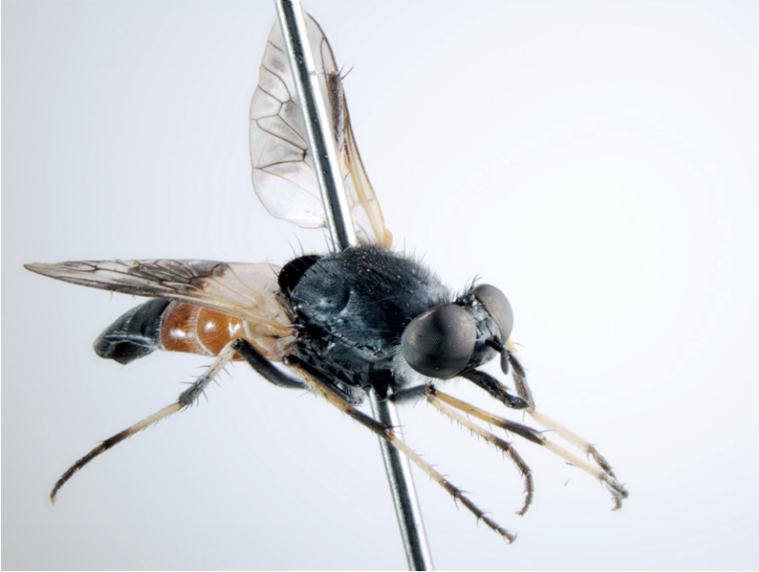
Figure 21. Acupalpa yalgoo sp. n., male, anterolateral view [576259]. Body length = 8.0 mm.