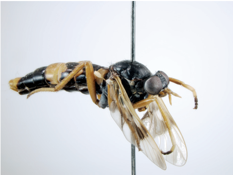
Figure 29. Pipinnipons sphecoda sp. n., female, anterolateral view [576265]. Body length = 10.0 mm.

Description. Body length= 10.0–14.0 mm. Head. Frons wider than ocellar tubercle, profile slightly transversely concave above antennae, pubescence absent, frontal vestiture as minute setae, surface texture as irregular longitudinal striations and transverse striations; gena with dark setae; parafacial overlain with silver pubescence; palpus yellow-orange; occiput glabrous, glossy black; antennal base raised; antennal length approximately equal to head; scape yellow, shorter than flagellum, scape with sparse black setae; flagellum yellow, base of flagellum with short dark setae. Thorax. Scutum glossy black, overlain with sparse yellow setae, sparse grey pubescence laterally; scutellum