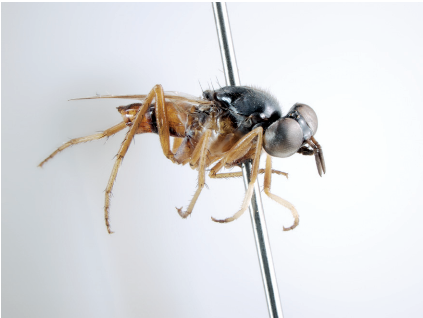
Figure 17. Acupalpa novayamarna sp. n., male, anterolateral view [576255]. Body length = 7.0 mm.

Description. Body length= 7.2 mm. Head. Frons wider than ocellar tubercle, profile rounded to slightly concave above antenna, pubescence absent or as silver patches along eye margin, frontal vestiture glabrous, surface texture smooth, face as narrow strip below antennal base, glabrous; gena with pale setae; parafacial overlain with silver pubescence; mouthparts relatively short (approximately equal to head length); palpus brown-black, narrowly cylindrical; occiput glabrous, glossy black; antennal base raised, antennal length approximately equal to head; scape orange-brown, length much shorter than flagellum, scape with sparse black setae; flagellum black, base of flagellum with short dark setae. Thorax. Scutum light grey to black, setal bases glossy black; scutellum overlain with dense, matt-black pubescence; pleuron orange, upper 1/3 concolourous with scutum, overlain with sparse silver-grey pubescence; wing markings banded infusate, dark yellow basally;