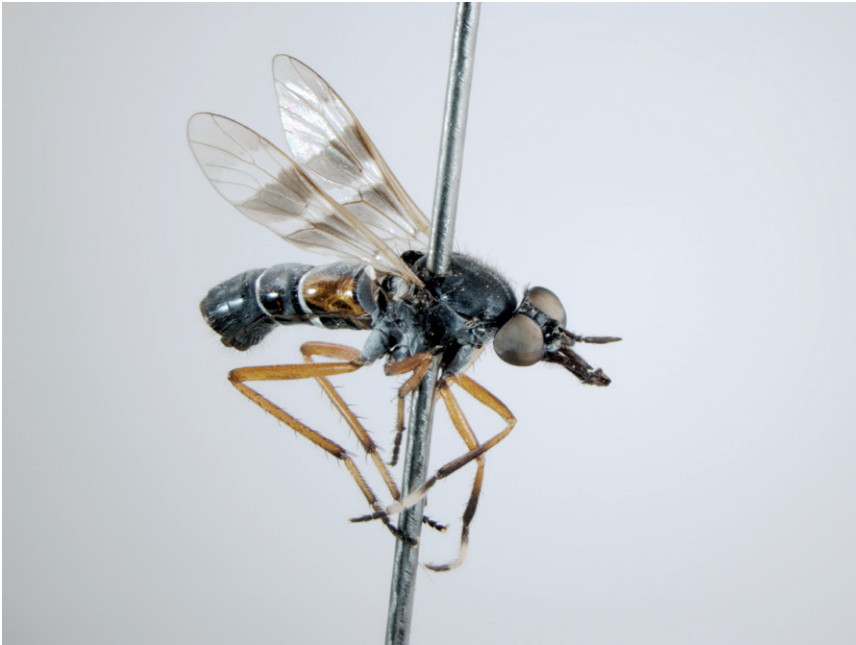
Figure 19. Acupalpa semirufa Mann, male, anterolateral view [576257]. Body length = 7.0 mm.

along eye margin, sparse silver-grey dorsally, frontal vestiture as small dark setae, surface texture verrucous; face projecting anteriorly with dark or pale setae; gena with pale setae; parafacial glabrous; mouthparts short (approximately equal to head length), or elongate, projecting anteriorly; palpus brown-black, acuminate; occiput glabrous, glossy black; antennal base raised; antennal length approximately equal to head; scape brown, length shorter than flagellum, scape with pale setae ventrally, shorter dark setae dorsally; flagellum black, base of flagellum with short dark setae. Thorax. Scutum uniform grey-black or light grey to black, setal bases glossy black; scutellum overlain with dense, matt-black pubescence; pleuron black, overlain with sparse silver-grey pubescence; wing markings dark, banded infuscate; haltere knob white, dark basally; coxae black; femora orange or yellow; tibia yellow-orange, darker distally; basitarsi yellow-orange, rest black, fore-basitarsus white distally, 2nd tarsomere basally. Scutal chaetotaxy: np , 4; sa , 1; pa , 1; dc , 3; sc , 1. Abdomen. Segment 2 in male, or segments 2–3 in female orange with black medial patch, rest of segments black, silver velutum dorsally on tergites (male) or absent (female); terminalia pale.