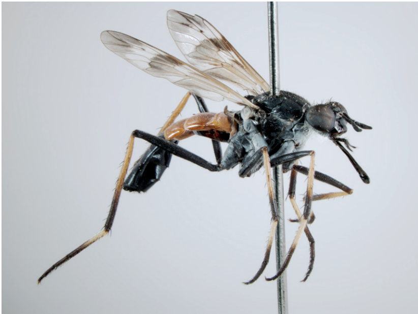
Figure 11. Acupalpa irwini Winterton, female, anterolateral view [576251]. Body length = 9.0 mm.

Type material. Holotype female, AUSTRALIA: Western Australia: 7.5 km WSW Lake Cronin, 32°23'S, 119°46'E, 19–26.ix.1978, T. F. Houston et al. (MEI029876) (WAM). Paratypes. AUSTRALIA: Western Australia: female, same data as holotype, (MEI029877) (WAM); male, 3 females, 53 km E Hyden nr. Emu Rock, 24–27.x.1985, R. W. Thorpe (MEI029502, 029503, 029504, 029505) (UCDC).