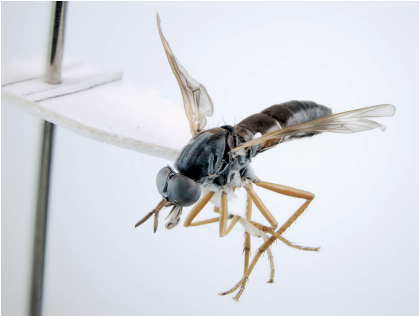
Figure 10. Acupalpa imitans (White), male, anterolateral view [576250]. Body length = 7.0 mm.

Redescription. Body length= 6.3–7.0 mm. Head. Frons wider than ocellar tubercle (female) or narrower (male), profile rounded above antenna, pubescence as silver patches along eye margin, frontal vestiture glabrous, surface texture as irregular longitudinal striations or smooth; face as narrow strip below antennal base, vestiture glabrous; gena with pale setae; parafacial glabrous; mouthparts relatively short (approximately equal to head length); palpus brown-black, narrowly cylindrical; occiput glabrous, glossy black; antennal base flat, frons roughly level with eye in profile (or near so); antenna longer than head; scape dark yellow, length approximately equal to flagellum, scape with sparse black setae; flagellum dark yellow, base of flagellum with short dark setae. Thorax. Scutum black, overlain with grey pubescence, brown stripes of pubescence more expansive posteriorly; scutellum overlain with dense, matt-black pubescence; pleuron black, overlain with sparse silver-grey pubescence; wing markings banded infuscate; haltere knob white; coxae black; femora orange or yellow; tibia yellow, apices sometimes dark; tarsi yellow, fore-basitarsus white. Scutal chaetotaxy: np 4–5; sa , 1; pa , 1; dc , 2; sc , 1. Abdomen. Dark, segments 2–3 red-brown medially, orange laterally, silver velutum absent (female) or small triangular patches on tergites 2–3 (male); terminalia pale.