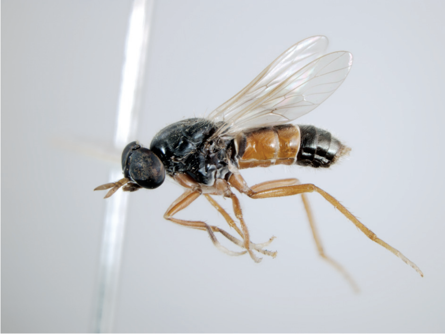
Figure 27. Pipinnipons kampmeierae sp. n., male, lateral view [576263]. Body length = 6.0 mm.