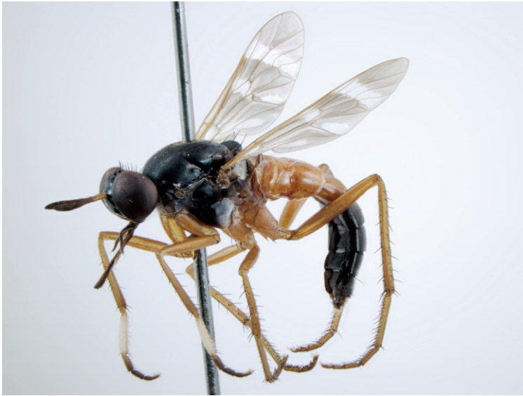
Figure 12. Acupalpa melanophaeos sp. n., female, anterolateral view [576252]. Body length = 9.0 mm.

frons roughly level with eye in profile (female); antenna longer than head; scape yellow, length much shorter than flagellum, scape with short, black setae; flagellum black, base of flagellum with short, dark setae. Thorax . Scutum light grey to black, setal bases glossy black; scutellum overlain with dense, matt-black pubescence; pleuron black (male) or darker anteriorly with dark orange posteroventrally (female), overlain with sparse silver-grey pubescence; wing markings banded infuscate; haltere knob brown; coxae orange; femora orange or dark yellow; tibia orange; tarsi yellow orange, dark distally, fore-basitarsus white. Scutal chaetotaxy: np , 4; sa , 1; pa , 1; dc , 1–2; sc , 1. Abdomen . Segments 1–3 yellow or orange, remaining segments black, silver velutum absent; terminalia dark.