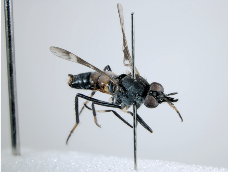
Figure 7. Acupalpa divisa (Walker), male, anterolateral view [576245]. Body length = 7.0 mm.

brous; mouthparts elongate, projecting anteriorly, or sometimes relatively short; palpus brown-black, acuminate; occiput glabrous, glossy black; antennal base raised, antennal length approximately equal to head; scape black, length approximately equal to flagellum, with sparse black setae; flagellum black, base of flagellum with short dark setae. Thorax. Scutum uniform grey-black, sometimes with faint white stripes; scutellum overlain with dense, matt-black pubescence; pleuron black, overlain with sparse silver-grey pubescence; wing markings dark banded infuscate; haltere knob white; coxae black; femora brown to black; tibia black; tarsi black; fore basitarsus white distally, 2nd tarsomere basally, remaining basitarsi yellowish. Scutal chaetotaxy: np , 4; sa , 1; pa , 1; dc , 3–4; sc , 1. Abdomen. Segments 2–3 yellow, remaining segments black (male tergites 1–3 dark medially), silver velutum dorsally on tergites (male) or absent (female); terminalia dark.