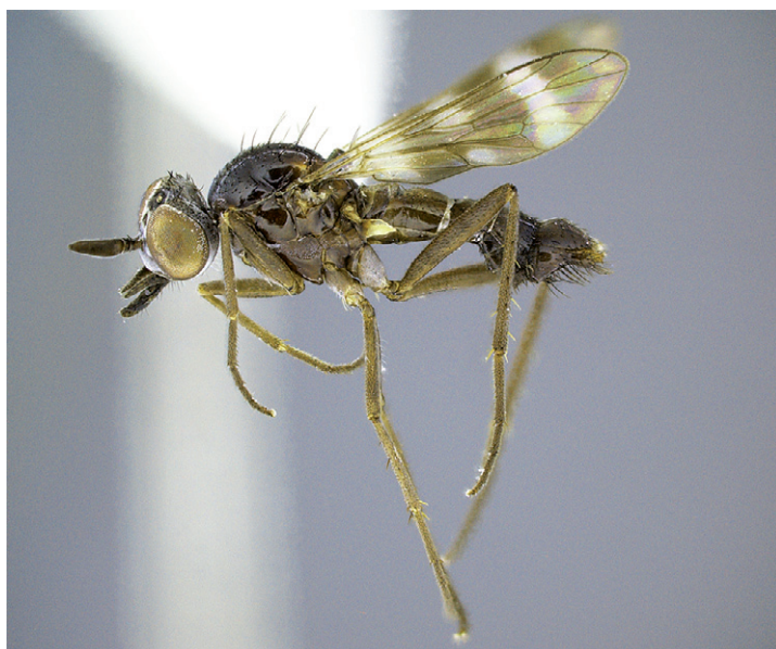
Figure 14. Acupalpa minuta sp. n., male, lateral view [581505]. Body length = 3.0 mm.

Description. Body length = 3.0 mm. Head. Frons wider than ocellar tubercle, profile rounded, level with eye, pubescence sparse silver-grey; frontal vestiture glabrous, texture smooth; lower frons and face broadly rounded, expansive; face vestiture glabrous; gena with pale setae; parafacia overlain with silver pubescence; mouthparts elongate, projecting anteriorly; palpus brown-black; occiput overlain with sparse, silver-grey pubescence; antennal base flat; antennal length longer than head; scape colour black, length much