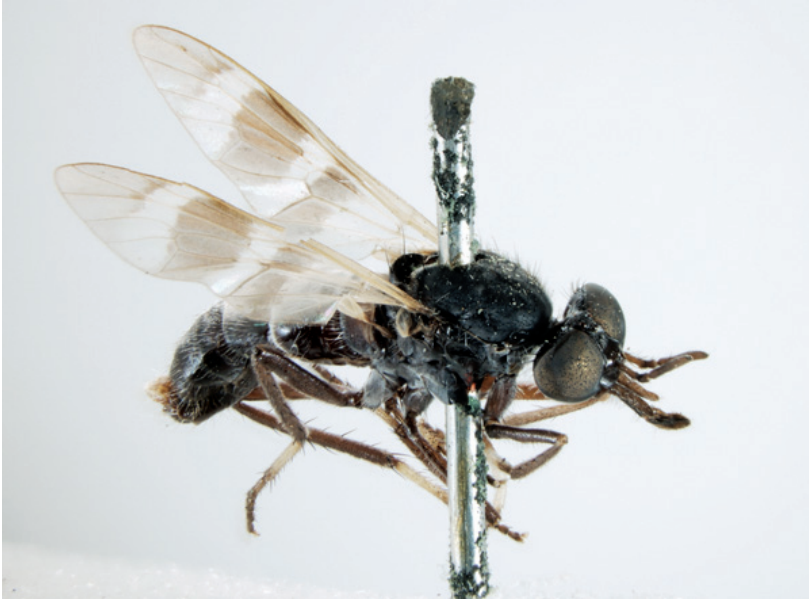
Figure 4. Acupalpa albimanis (Kröber), comb. n., (Holotype of A. pollinosa ), male, anterolateral view [Morphbank: 576222]. Body length = 6.5 mm.

tarsomere cream to white. Scutal chaetotaxy (macrosetae pairs): np (notopleural), 4; sa (supra-alar), 1; pa (post-alar), 1; dc (dorsocentral), 2–3; sc (scutellar), 1. Abdomen . Black, covered with silver velutum dorsally on tergites (male only); terminalia pale.