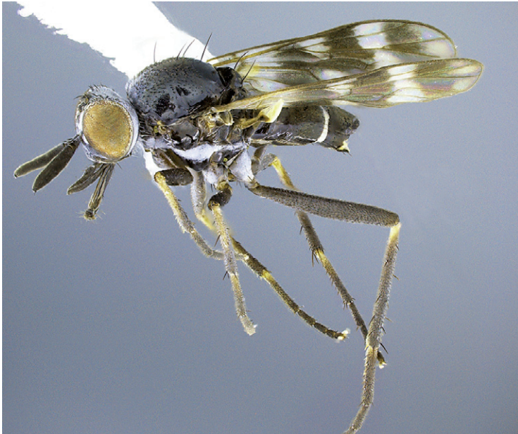
Figure 15. Acupalpa minutoides sp. n., male, lateral view [581506]. Body length = 3.5 mm.

cence and dark setae; femora brown to black; tibia black, yellow-orange basally; tarsi brown. Scutal chaetotaxy (macrosetae pairs): np , 2, sa , 1, pa , 1, dc , 2, sc , 1. Abdomen . Colouration brown, tergites 2–4 with bronze pubescence, silver velutum absent; terminalia dark.