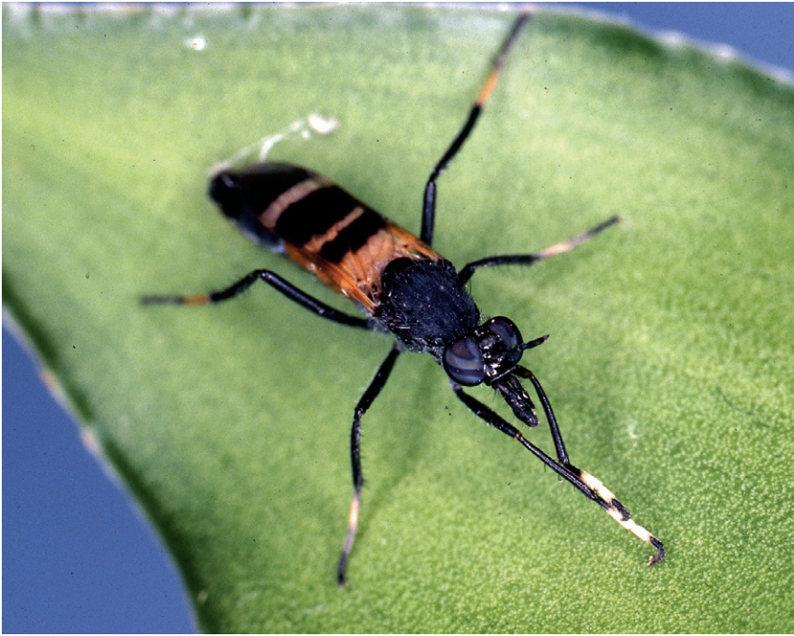
Figure 1. Acupalpa divisa (Walker), female, Brisbane, Queensland. Body length= 7.0 mm. (Photo: Anthony O'Toole, University of Queensland).