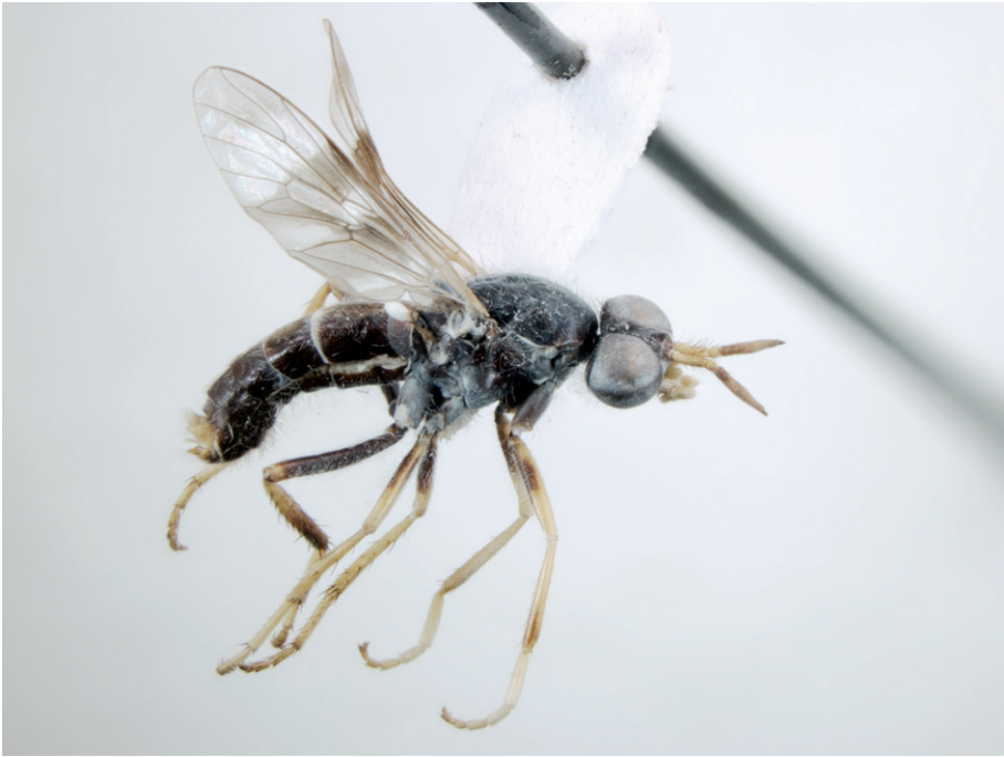
Figure 25. Pipinnipons chauncyvallis sp. n., male, lateral view [576261]. Body length = 7.0 mm.