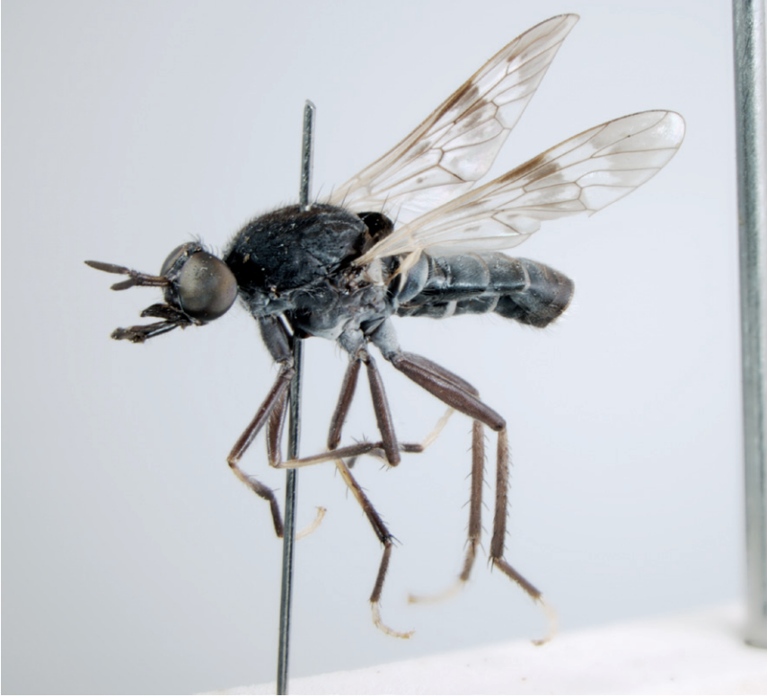
Figure 5. Acupalpa albitarsa Mann, male, anterolateral view [576246]. Body length = 7.0 mm.