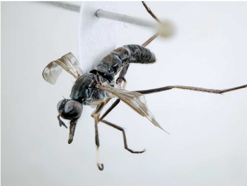
Figure 20. Acupalpa westralica sp. n., female, anterolateral view [576258]. Body length = 8.0 mm.

Description. Body length = 8.0 mm. Head. Frons wider than ocellar tubercle, profile rounded above antenna, glabrous or with minute setae, surface texture smooth; face broadly rounded, expansive, with dark or pale setae; gena with pale setae; parafacial glabrous; mouthparts elongate, projecting anteriorly; palpus brown-black, narrowly cylindrical; occiput glabrous, glossy black; antennal base flat; frons roughly level with eye in profile; antennal length approximately equal to head; scape yellow-brown, shorter than flagellum, scape with sparse black setae; flagellum black, base of flagellum without setae. Thorax. Scutum uniform grey-black with diffuse brown and cream stripes; scutellum