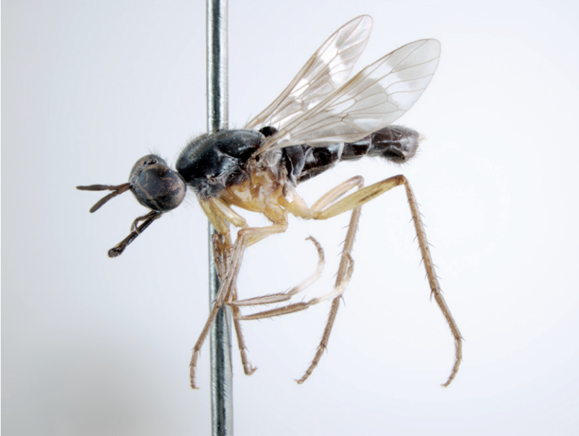
Figure 16. Acupalpa notomelas sp. n., male, anterolateral view [576254]. Body length = 6.0 mm.

Description. Body length= 6.2–8.0 mm. Head. Frons wider than ocellar tubercle, profile rounded above antenna, glabrous or silver pubescent patches along eye margin [some sparse pubescence dorsally], frontal vestiture as small dark setae, surface texture smooth, face broadly rounded, vestiture as dark or pale setae; gena with pale setae or with dark setae (ventrally); parafacial glabrous; mouthparts elongate, projecting anteriorly; palpus brown-black, narrowly cylindrical; occiput overlain with sparse, silver-grey pubescence, antennal base flat; antennal length approximately equal to head; scape brown, length shorter than flagellum, scape with sparse black setae; flagellum dark, base of flagellum without setae. Thorax. Scutum light grey to glossy black, setal bases glossy black, overlain with faint stripes of grey pubescence; scutellum overlain with dense, matt-black pubescence; pleuron yellow-orange in lower 2/3, upper 1/3 con-colourous with scutum, overlain with sparse silver-grey pubescence; wing markings banded infuscate; haltere knob white, dark basally; coxae yellow-orange; femora with darker fore femur, rest yellow-orange; tibia and tarsi dark yellow; fore-basitarsus white, darker basally, 2nd tarsomere white basally, remaining basitarsi yellow-brown. Scutal chaetotaxy: np , 4; sa , 1; pa , 1; dc , 2; sc , 1. Abdomen. black, silver velutum absent; terminalia pale.