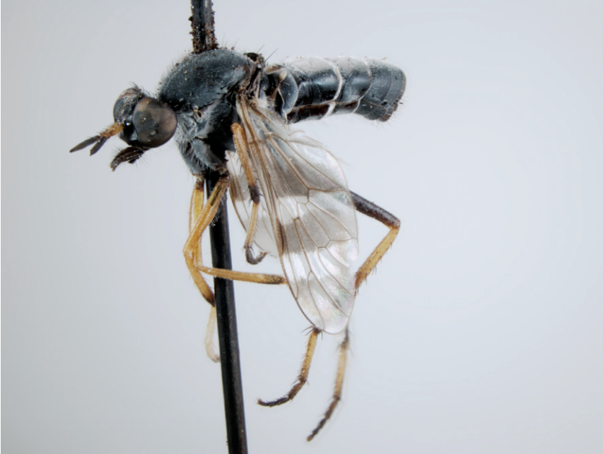
Figure 18. Acupalpa rostrata Kröber, Neotype male, anterolateral view [576256]. Body length = 7.0 mm.

species herein a neotype is designated to stabilise the taxon and remove any possibility of confusion in the future. Acupalpa rostrata is differentiated from other Acupalpa species by the unique leg and antennal colouration.