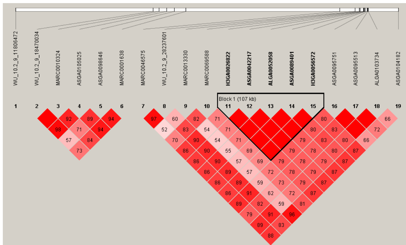
Figure 3. The LD pattern for the significant SNPs associated with intramuscular fat content on chr. 9. Values in boxes are LD ( r^2 ) between SNP pairs and the boxes are colored according to the standard Haploview color scheme. LD, linkage disequilibrium; SNPs, single nucleotide polymorphisms.

note, no common SNPs for IMF were found in the two populations, Duroc×Erhualian F2 animals identified in Large White×Minzhu intercross population was confirmed by Ma et al [24]. One reason for the lower reproducibility is that GWAS can generate some false positive and false negative associations, although sophisticated statistical tests have been proposed to reduce false positives. Another possible reason is that IMF content is complex trait, for which gene-gene and gene-environment interactions possibly have different genetic effects across population. Therefore, further confirmation of these associations in larger independent populations would be warranted to test if the significant SNPs identified in this study are population-specific before their incorporation into breeding programs.