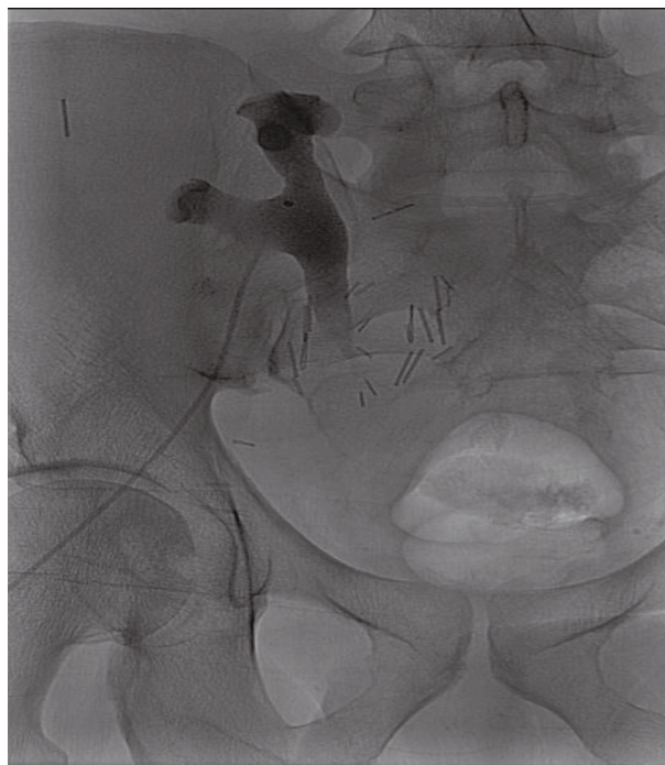
FIGURE 2: Postnephrostogram on readmission with no distal flow of contrast in the ureter.