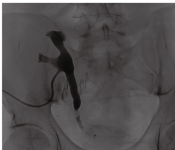
FIGURE 3: Posttransplant day 44 nephrostogram with mid to distal ureter stricture and clot presence.

(Figure 4). Again, a large blood clot was retrieved from the transplanted ureter. Nephrostomy tube was removed with the internalization of stent. The patient has since recovered with the above complication and procedures contributing to prolonged morbidity. The allograft is functional with baseline creatinine and urine output. The patient continues on oral antibiotics for the prevention of infection. We reviewed the cause for initial ureteric injury and most likely it resulted from the kinking of the stent inside the ureter, and during removal with cystoscopy, it resulted in laceration of the