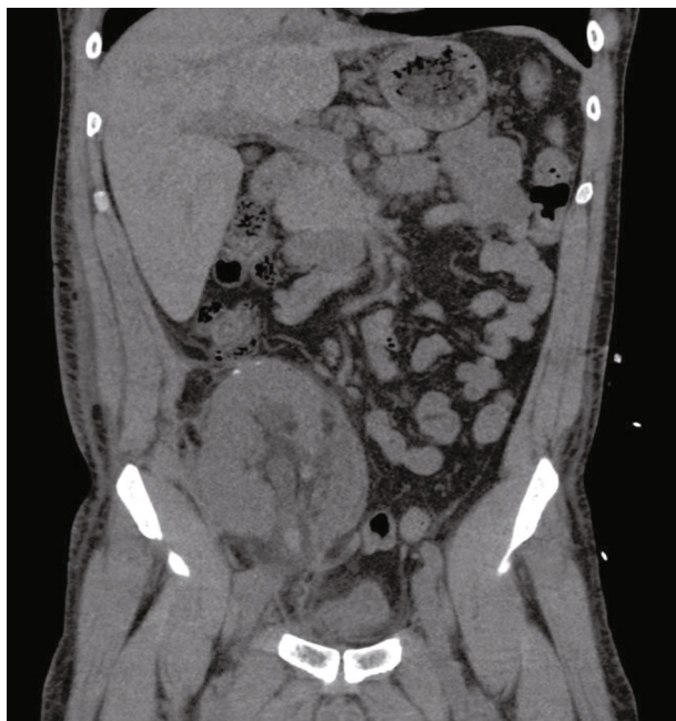
FIGURE 1: Coronal view of the CT scan showing hydronephrosis and clot in the transplanted ureter.