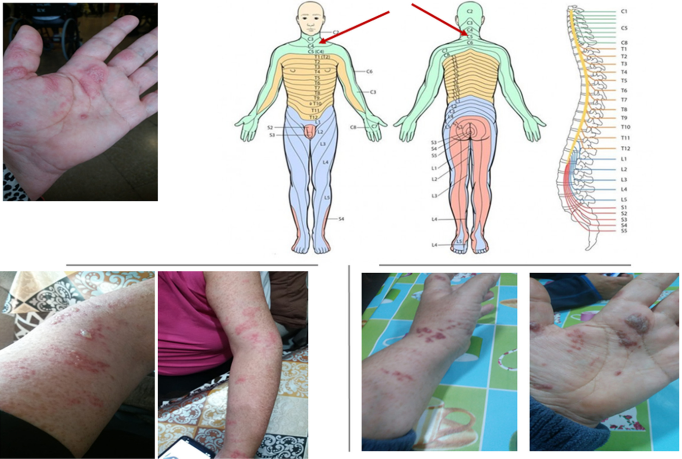
Fig. 2. Dermatological photographs showed some crusted and aggregated vesicles upon an erythematous base spreading over an area corresponding to the C3–C5 dermatomes on the arm, hand and left chest.