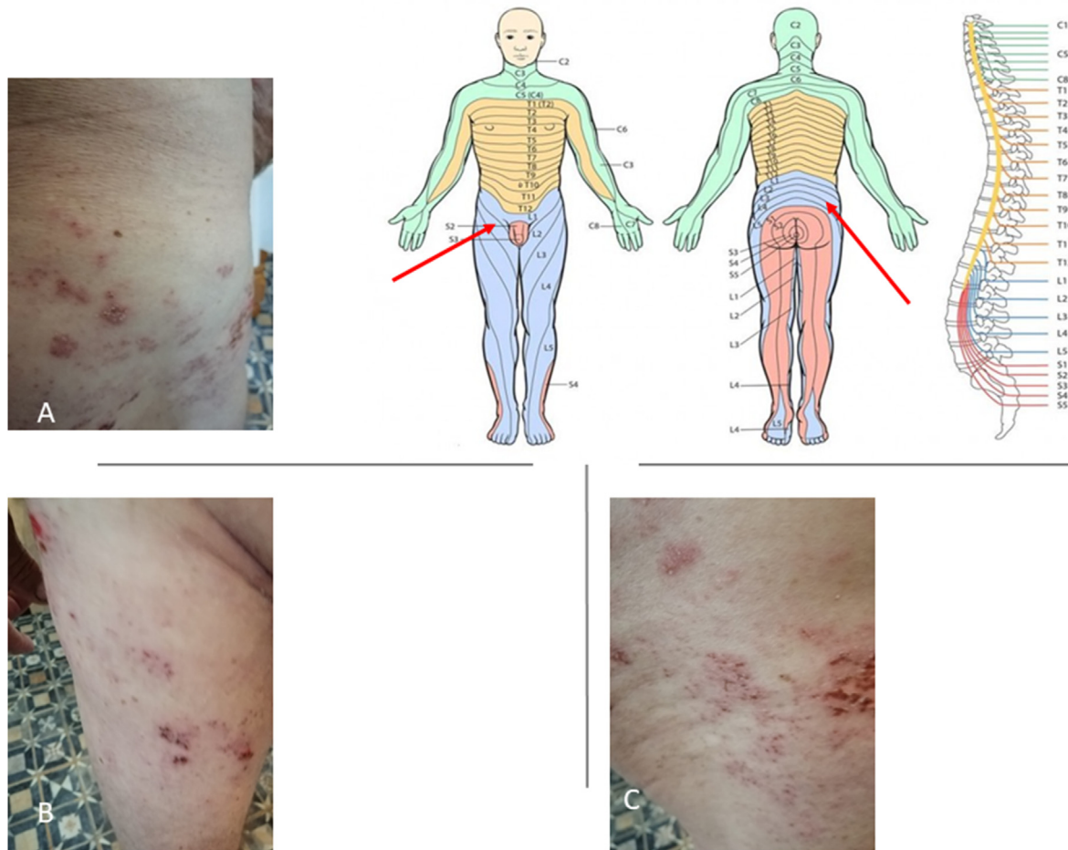
Fig. 1. The macroscopic examination showed some scabby and erythematous lesions with vesicles on the right-hand-side lumbar area and gluteus. Images B and C) show lesions on the anterior part of the right thigh corresponding to the L1-L3 dermatomes.