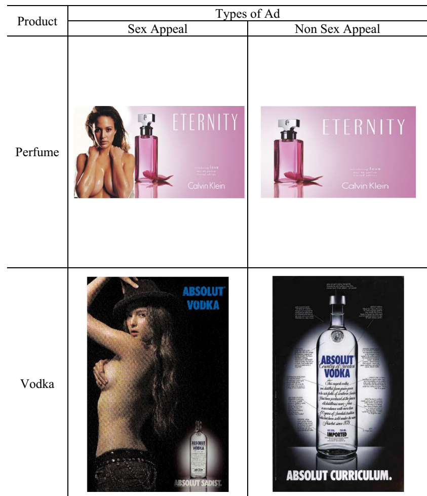
Fig. 1 Study 1 advertising stimuli

process for the second ad. The presentation order of the ads and dependent variables was counterbalanced across participants.