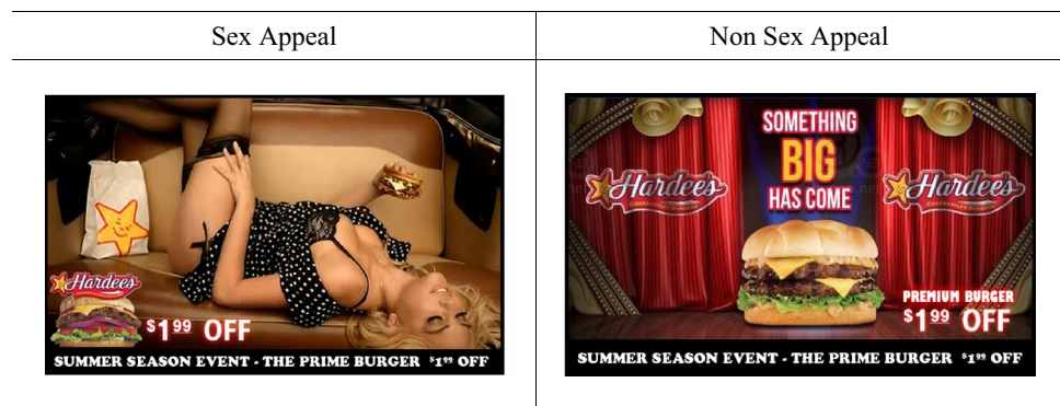
Fig. 3 Study 2 advertising stimuli

In addition, we also changed from a death-containing video clip to an online newspaper article containing the news of people committing suicide. This change could potentially enhance the external validity of our findings because many people are exposed to death-related news from online sources, and death related news occurs in many forms that are not directly related to war and conflict (as were the materials in Study 1). Indeed, only one study that we know of (Echebarria-Echabe and Perez 2015) has manipulated thoughts of death via information about suicides and it used pictures. Finally, Study 2 measured two dependent variables, advertising attitudes and purchase intention, which was assessed with a several item measure instead of the single item in Study 1.