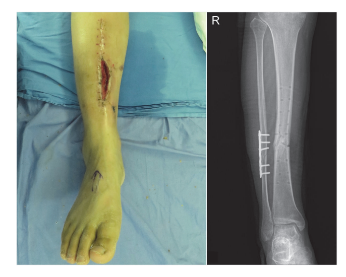
FIGURE 1: Case 17, a 33-year-old man with chronic osteomyelitis of the tibia. The left figure is the preoperative clinical photograph. The right figure is the preoperative anteroposterior X-ray photograph.

At admission to our institute each patient routinely received physical examination and laboratory tests. Occasionally they presented with vague symptoms including pain, atrophic nonunion, pain, draining sinus, swelling, local warmth, erythema at involved site, and necrosis of wound edges. However, the results of laboratory tests revealed that inflammatory markers such as erythrocyte sedimentation rate (ESR), the C-reactive protein (CRP), and white blood cell count (WBC) did not change correspondingly. Moreover, all patients received plain radiographs and computed tomography (CT) tests. Bone resorption, sequestration, periosteal