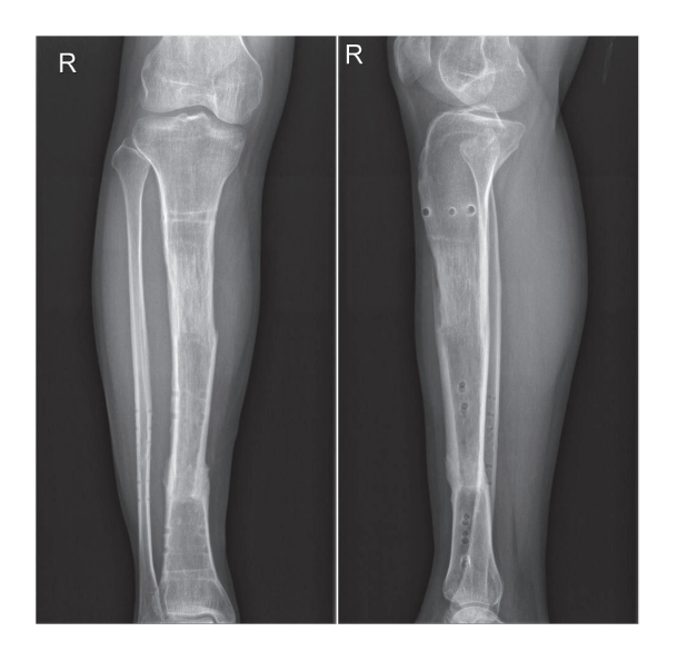
FIGURE 4: Anteroposterior and lateral X-ray photographs taken 3 months after the external fixation was removed.

includes bone results and functional results. Bone results have four items for evaluation (bone union, infection, deformity, and limb length discrepancy), and the functional results have five items for evaluation (observable limp, adjacent joint stiffness, dystrophy of soft tissue, pain, and incapability of motivation such as unemployment or inability to return to daily activity). The outcome of both parts can be categorized into four grades such as excellent, good, fair, and poor.