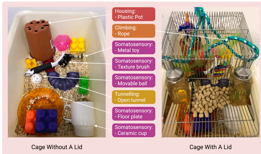
Figure 1. Assembled environmental enrichment home cage (40 cm × 28 cm × 18 cm) demonstrating examples of each of the enrichment items