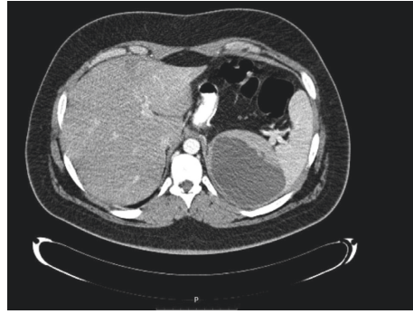
FIGURE 1: Splenic abscess of 10 cm with no evidence of leakage.