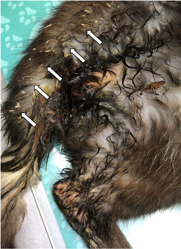
FIGURE 1 Clinical aspects of a cutaneous myiasis in a domestic cat by Calliphora vicina (Case 1): lower abdomen and inner side of thighs showing dipteran larvae (arrows) on the fur

Italy), was admitted at a veterinary clinic on 11 April 2018 after she had been run over by a car, suffering a debilitating pelvis fracture followed by immobility. In the lower abdomen and inner side of thighs, the presence of larvae in the fur (Figure 1) and over decubitus ulcers was noticed. A total of 26 live dipteran larvae, 5.98 \pm 0.67 mm long, were collected in the fur and over the decubitus ulcers. All other larvae were mechanically removed, the ulcers were washed with hydrogen peroxide and the anti-inflammatory drug meloxicam was prescribed.