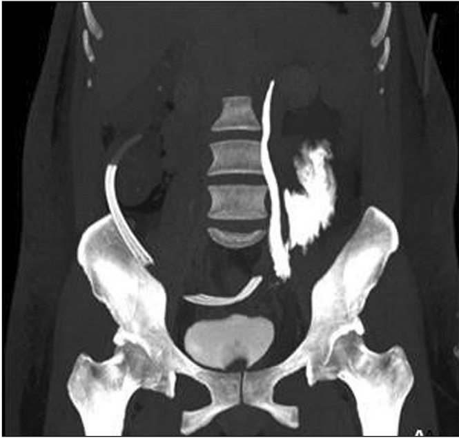
Figure 1A. CT-urogram of a left ureteral injury lesion after a hysterectomy procedure.