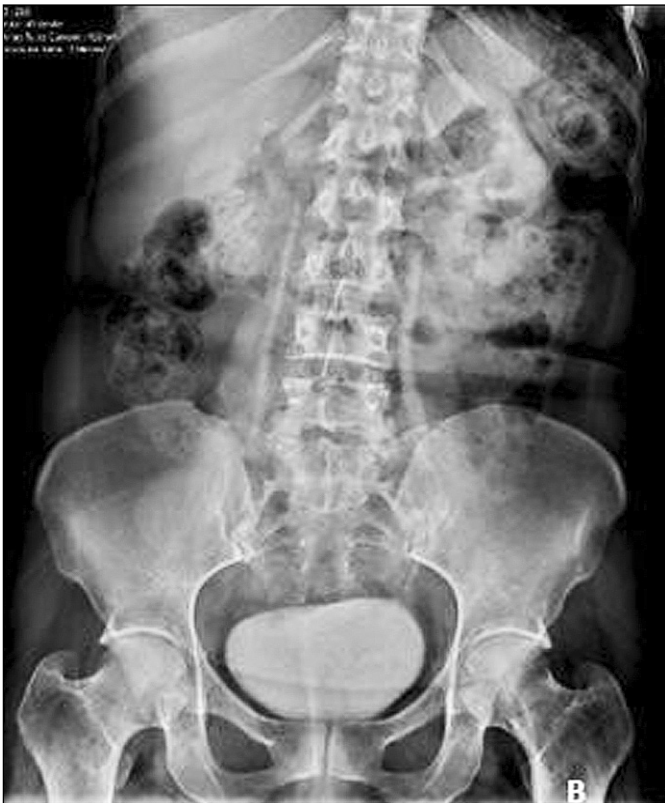
Figure 1B. Urography performed after ureteral reimplantation.

was 5.7 months (1–14). This wide range of time to reparation is due to a patient with a delayed ureteral reimplantation due to a misdiagnosed ureteral lesion