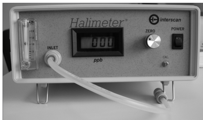
Figure 2. Halimeter® RH 17.

Halitometry - to check for VSC concentrations - in parts per billion (ppb) - we used a Halimeter® RH 17, for these measures (Figure 2).