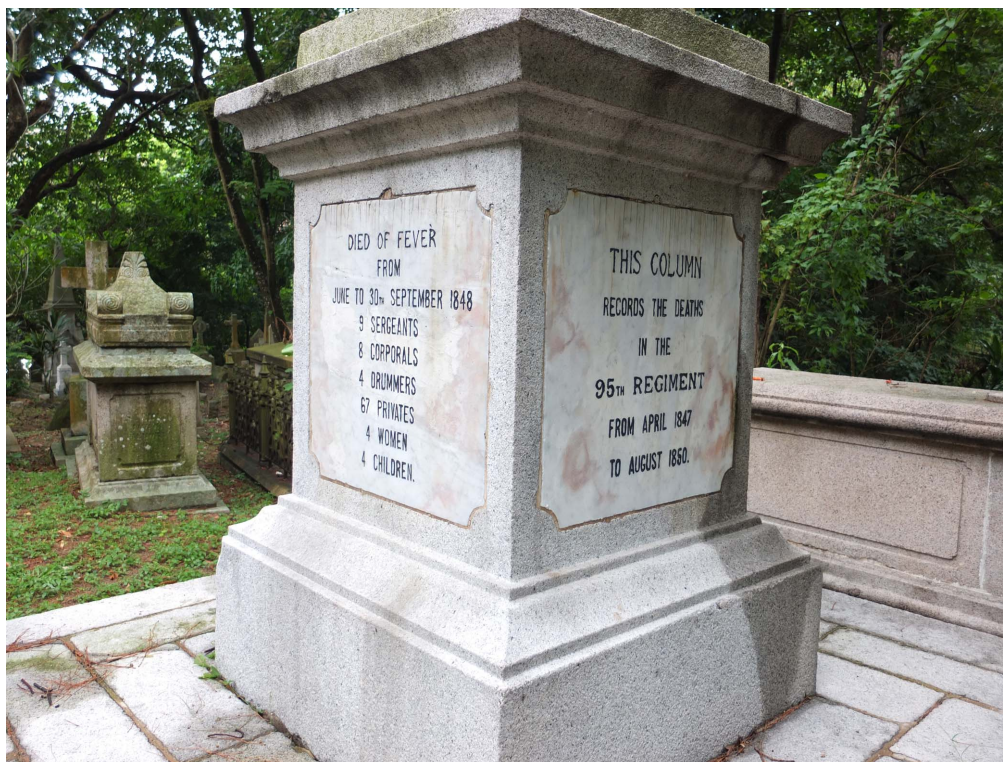
Figure 5 A tombstone for British garrisons who died in Hong Kong with fever at the Hong Kong Cemetery of the Happy Valley district.