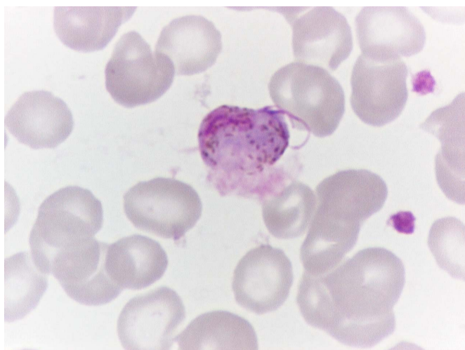
Figure 3 Exflagellated gametocyte of Plasmodium vivax in human blood (Giemsa stain; original magnification, \times 1000 ).

In 1880, an Amoy official consulted Manson for a facial eruption and a harsh and loud cough. He coughed out blood-stained sputum which missed the spittoon and fell onto Manson's office carpet. Manson picked up the sputum and found large operculated eggs under his microscope (Figure 4). When these were put in water jars, they hatched into ciliated creatures after 2 weeks at tropical room temperature. 9 Manson later found that this fluke Paragonimus westermanii ( Distoma ringeri ) in the postmortem examination of a patient suffering from endemic haemoptysis with large operculated eggs in the sputum. He proposed that this lung fluke should have an intermediate host in fresh water crustaceans such as snails for the completion of its life cycle. His hypothesis was finally proven in 1916 by Nakagawa. 10 His fresh water snail theory was later applied successfully to schistosomiasis. Manson has made many important contributions to tropical diseases including the discovery of Filaria demarquaii ( Mansonella ozzardi ), Filaria diurna ( Loa loa ), Filaria perstans ( Mansonella perstans ), the tapeworm Bothriocephalus mansoni ( Spirometra [Diphyllobothrium] mansonoides ), Schistosoma mansoni , and the