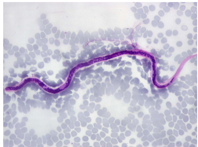
Figure 2 Microfilaria of Wuchereria bancrofti with sheath in the peripheral blood of human (Giemsa stain; original magnification, \times 200 ).

His eye-opening research findings were published in the Customs Gazette and later the Journal of Linnean Society of London, Zoology in 1878. 6 While his paper was read out in the society's meeting, one critic remarked that 'what they had heard represented either the work of a genius or more likely the emanations of a drunken Scots doctor in far-off China, where everyone was aware, they drank far too much whisky'.