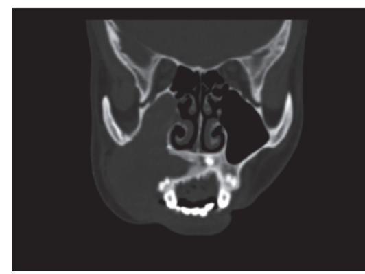
Figure 1. Computed tomography images of the basaloid squamous cell carcinoma. (A and B) The mass invaded the maxillary sinus and the central region of the hard palate.

The prognosis of patients with BSCC compared with patients with conventional SCC remains uncertain. Winzenburg et al (10) first identified that distant metastases occurred in 52% of patients with BSCC and in 13% of patients with poorly differentiated SCC. Soriano et al (11) showed that patients with SCC were associated with notably higher survival rates when compared with patients with BSCC; furthermore, the rate of distant metastasis was six times higher in the cases of BSCC. However, de Sampaio Góes et al (12) declared that the prognosis did not differ between patients with BSCC of the oral cavity and those with conventional SCC.