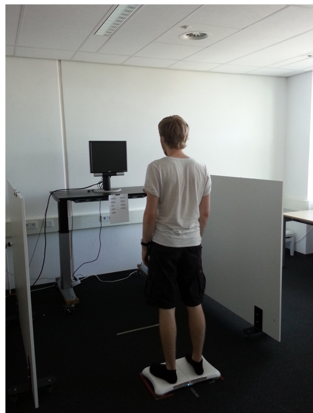
FIGURE 1 | Wii Balance Board set-up.