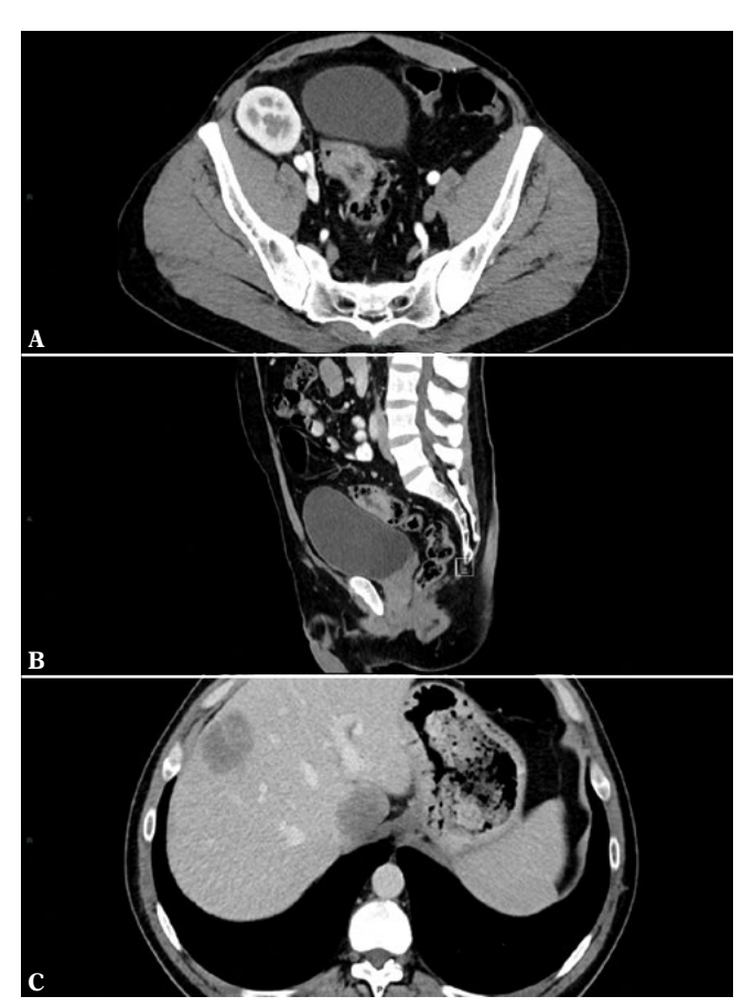
Fig. 2. CT in the initial staging of a rectosigmoid junction tumor. Axial (A) and sagittal (B) sections through the tumor. Axial section in the upper abdomen (C) showing the presence of liver metastases

to image many different structures, such as abdominal viscera, pelvic organs, lungs and bones, with a single examination. The presence of ionizing radiation limits the usage of CT. The American College of Radiologists (ACR) has summarized the indications for abdominal CT (Tab. 3)<sup>(20)</sup>.