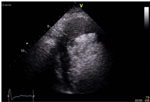
Figure 1 Contrast echocardiography study confirmed the presence of an apical sessile thrombus and a severe anteroapical hypokinesia with an EF of 35%.