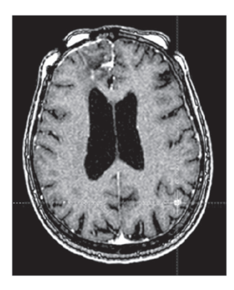
Figure 1. Second Gamma Knife treatment: 20 Gy for a single left posterior parietal metastatic lesion.