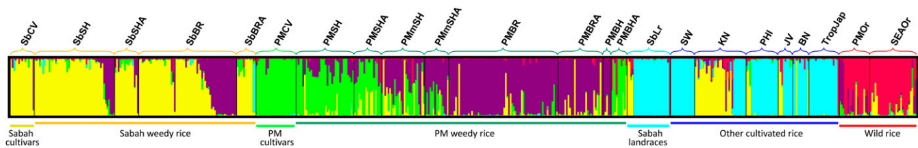
Figure 2 STRUCTURE output at K = 5 . Abbreviations used: SbCV, Sabah cultivated rice; PMCV, Peninsular Malaysia cultivated rice; SbSH, Sabah weedy rice with strawhulls and no awns; PMSH, Peninsular Malaysia weedy rice with strawhulls and no awns; PMmSH, Peninsular weedy rice with intermediate strawhulls and no awns; SbSHA, Sabah weedy rice with strawhulls and awns; PMSHA, Peninsular Malaysia weedy rice with strawhulls and awns; PMmSHA, Peninsular Malaysia weedy rice with intermediate strawhulls and awns; SbBR, Sabah weedy rice with brownhulls and no awns; PMBR, Peninsular Malaysia weedy rice with brownhulls and no awns; SbBRA, Sabah weedy rice with brownhulls and awns; PMBRA, Peninsular Malaysia weedy rice with brownhulls and awns; PMBH, Peninsular Malaysia weedy rice with blackhulls and no awns; PMBHA, Peninsular Malaysia weedy rice with blackhulls and awns; PMOr, Peninsular Malaysian Oryza rufipogon ; PMLr, Malaysian landraces; TropJap, tropical japonica ; SEAOr, O. rufipogon accessions representing other Southeast Asian countries (Thailand, Cambodia and Myanmar).

Because a plot of -\ln likelihood values at successive K -values suggested that K = 5 might be a better model than K = 4 for the data (see Supplementary Figure S2A, B, C), we examined multiple run outputs at this K -value. These outputs were stable across replicate runs, and inferred membership assignments for previously-analyzed accessions matched the earlier results (Song et al. 2014). We therefore considered K = 5 to be the biologically most realistic population number. Genetic subgroups at K = 5 are shown in Figure 2 and correspond to the following groups of accessions: (1) Sabah cultivars plus many of the Sabah weed accessions, along with indica rice landraces from Sabah and neighboring countries (yellow); (2) Peninsular Malaysia cultivars and their Peninsular Malaysia weedy descendants (green); (3) many Peninsular Malaysia weeds plus some Sabah weeds and a few wild rice accessions (purple); (4) tropical japonica rice varieties, including most landraces from Sabah and neighboring countries, along with US crop varieties and two Sabah weed accessions (blue); and (5) most wild rice accessions (red).