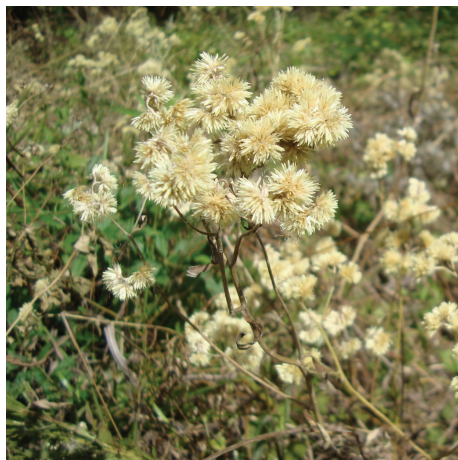
FIGURE 1: Inflorescences of Achyrocline satureioides (Lam.) DC., Asteraceae.

We also have recently described the simultaneous incorporation of these poorly soluble flavonoids of Achyrocline satureioides extract into nanoemulsions by means of spontaneous emulsification intended for topical use [6]. Such a procedure proved to be able to efficiently incorporate the main flavonoids from the hydroethanolic extract in monodisperse nanoemulsions (200 nm range) consisting of a medium chain triglycerides oil core stabilized by a binary mixture of surfactants (egg lecithin and polysorbate 80). Flavonoids seem to be located in the oil phase of nanoemulsions since they were not detected in the aqueous phase after separation on ultrafiltration membranes. The 3- O -MQ release rate was influenced by the extract content in the nanoemulsion with approximately 90% released after 8 h of kinetics. The first-order model provided the most satisfactory fitting of the release data from extract-nanoemulsions [6].