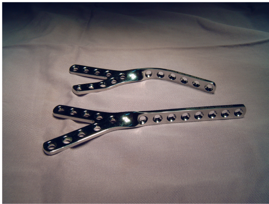
Figure 1. The anterolateral arthrodesis plate. Two different sizes of anterolateral arthrodesis plates are shown; one of the plates has been moulded into the appropriate shape to obtain the “arthrodesis position” of the leg. doi:10.1371/journal.pone.0085868.g001

which prove relevant in a HA context (pain and ability to walk) and on the measurement of any existing limb-length discrepancy (Table 2). Radiological evaluation was based on a standardized anterior-posterior radiograph of the hip and the pelvis and a lateral radiograph of the hip.