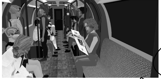
Figure 2. The virtual reality equipment (top panel) and scenario (bottopanel).

another motion that randomized the direction of their gaze. In addition, several of the avatars responded to participants' gaze by looking in their direction, which was enabled through head tracking of the participants. When looked at, one particular avatar would occasionally smile at the user. The audit for the scene comprising background tube noise and low-level snippets of conversation, was rendered in stereo, without spatialization, using a Creative sound card.