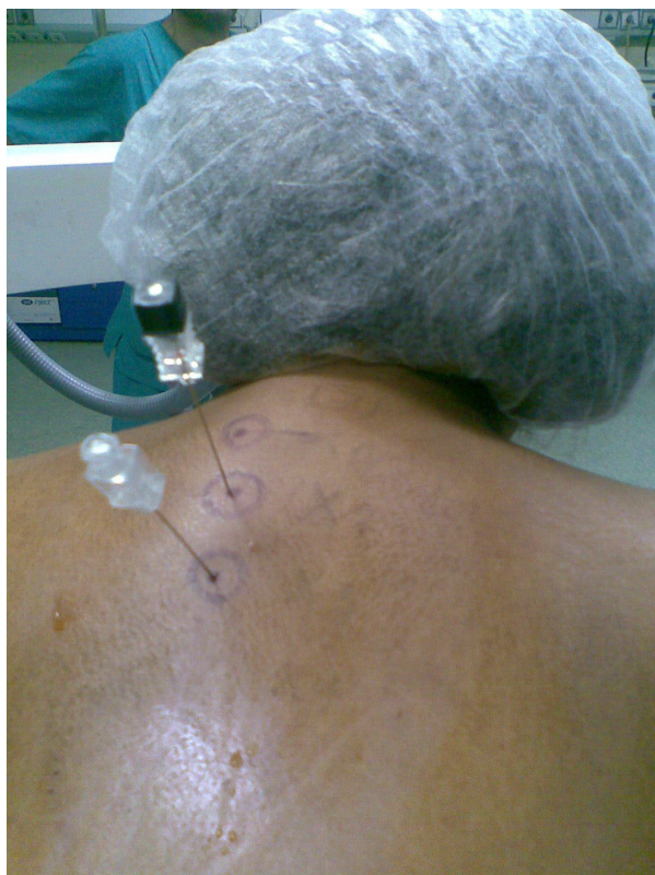
Figure 1 Thoracic paravertebral block at T1, T2, and T3 levels.

The thoracic paravertebral block (TPVB) was performed according to the method of Eason and Wyatt. 3 Palpation was used to localize the seventh cervical vertebra (C7) and first thoracic vertebra (T1) at the tip of the scapula. Spinous processes of T1 through T5 were outlined, and a point was marked 2.5 cm left lateral to each of the spinous processes (Figure 1). A vertical line was drawn to connect these points. The back was cleaned by a sterile technique using povidone-iodine. Skin and subcutaneous tissue were