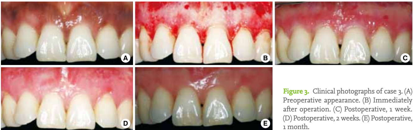
Figure 3. Clinical photographs of case 3. (A) Preoperative appearance. (B) Immediately after operation. (C) Postoperative, 1 week. (D) Postoperative, 2 weeks. (E) Postoperative, 1 month.