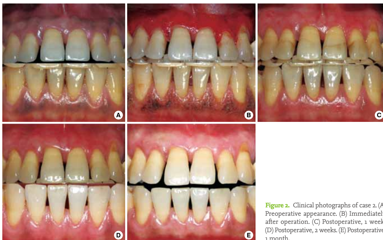
Figure 2. Clinical photographs of case 2. (A) Preoperative appearance. (B) Immediately after operation. (C) Postoperative, 1 week. (D) Postoperative, 2 weeks. (E) Postoperative, 1 month.

A 40-year-old female had a chief complaint of pigmented gingiva visible while she smiled and spoke. A severely melanin hyperpigmented gingiva was found at the labial surfaces of the maxillary arch (Fig. 3). The patient's medical history was noncontributory. One week after the surgery, gingiva presented slow epithelization with immature healing. The patient complained of mild pain in the maxillary gingival area. Two weeks after, the maxillary gingiva showed almost complete healing. One month after, the gingival color was significantly improved without recurrence or gingival recessions or deformities. The patient was satisfied with the esthetically improved gingival color.