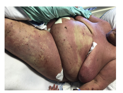
Fig 1. Infiltrated erythematous plaques covering greater than 50% body surface area with erosions and excoriations.