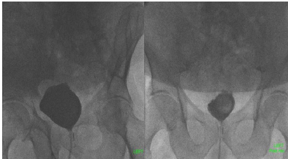
FIGURE 3: Ascending cystogram two weeks post-operative repair

To the left filling phase and to the right post-micturition phase, both show no contrast extravasation.