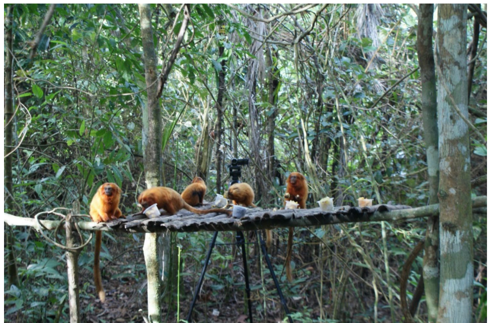
Fig. 1 Seven pots containing different types of food attached to a platform during a trial to understand the role of food-transfers in golden lion tamarins at Poço das Antas and Affetiva, Fall 2014. One of the two cameras used to record trials can be seen in the background

In the first phase, each group was exposed to five food options at the same time. These were: apple, banana, cricket, grape, and mealworm (see Table S2). Food options were arranged semi-randomly to ensure that most of the time the insect types were not adjacent to each other, and that when the trial did not occur on a platform (where the pots could be arranged in a circle) the familiar food had a fairly central place. Both insects and fruits were used to replicate the golden lion tamarins' natural diet. Two types of food were provided: familiar and novel food. Familiar foods are food types that the golden lion tamarins in this population will have previously eaten prior to the start of this experiment, while novel foods are food types that the golden lion