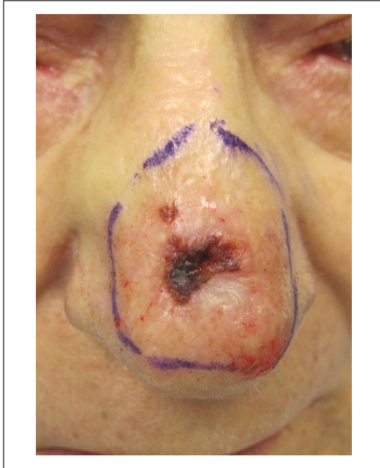
Figure 1. Pre-operative view of the patient's nose, displaying the biopsy-confirmed basal cell carcinoma (BCC) with pink, distorted skin adjacent to the lesional area.