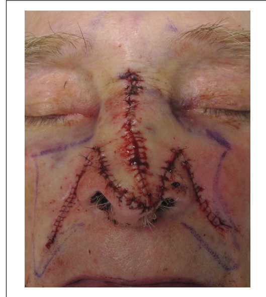
Figure 3. Post-nasal reconstruction, displaying the bilateral malar transposition flaps adjoining along the midline of the nose, extending from the bridge to the tip, with minimal tension on the surrounding critical structures.

The Peng flap was reported as a “pinch” modification of Rintala’s glabellar linear advancement flap for repair of large defects extending into the dorsum and nasal tip. 7 It is an advancement rotation flap that recruits skin from the bilateral nasal sidewalls to re-create the convexity of the nasal tip in a single step. Due to the origin of the skin involved and the course of flap advancement, skin color and texture are preserved alongside nasal architecture. This repair could not be executed for the patient as the defect was too large and involved too much of the upper dorsum. Furthermore, it