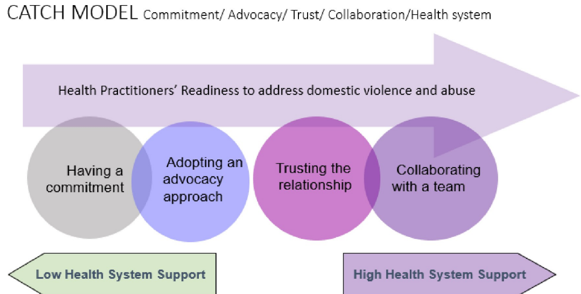
Fig 2. Health practitioner's readiness model: The CATCH model.

https://doi.org/10.1371/journal.pone.0234067.g002