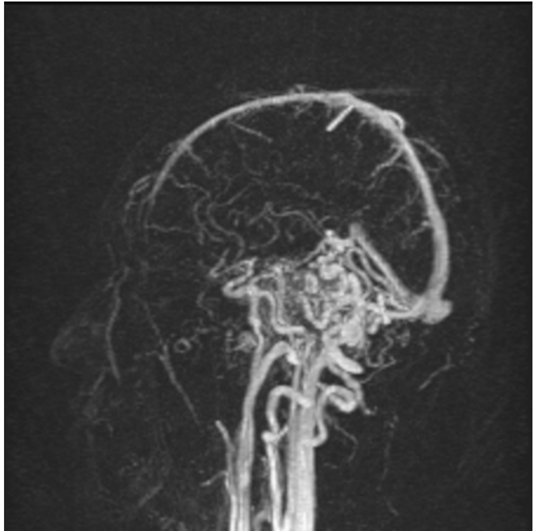
FIGURE 5: MRA head with contrast, sagittal section