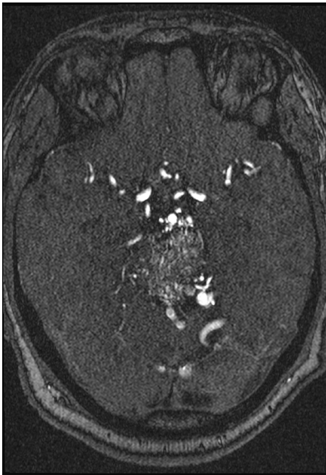
FIGURE 4: MRI head with contrast, axial section

Feeders were mostly from the posterior circulation, with three intranidal aneurysms, all draining into the deep venous system (Figures 5-7). The AVM was deemed inoperable, and the patient was treated with onyx embolization for two of the three feeding vessel aneurysms. Even following the treatment, the symptoms persisted, affecting the patient's quality of life significantly. He was diagnosed with major depressive disorder (MDD) six months after the diagnosis and treatment and was admitted a year later with suicidal ideation and substance use