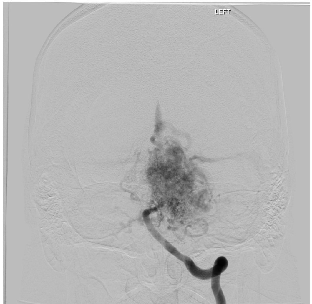
FIGURE 7: Angiography of vertebral artery, coronal section