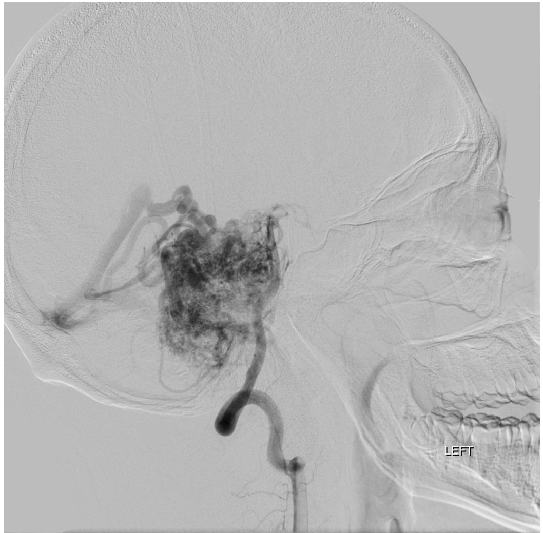
FIGURE 6: Angiography of vertebral artery, sagittal section