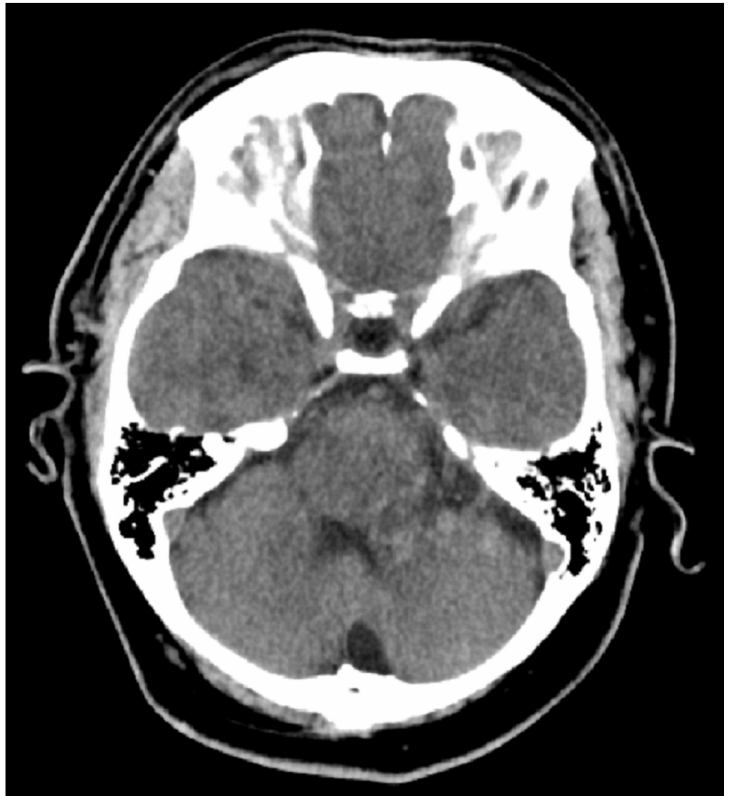
FIGURE 1: CT head without contrast, axial section

MRI brain (Figures 2-4) identified Spetzler-Martin grade IV brainstem AVM measuring approximately 2.8 x 3.4 x 4.2 cm primarily involving the left paracentral brainstem (midbrain, pons, and cerebellum).