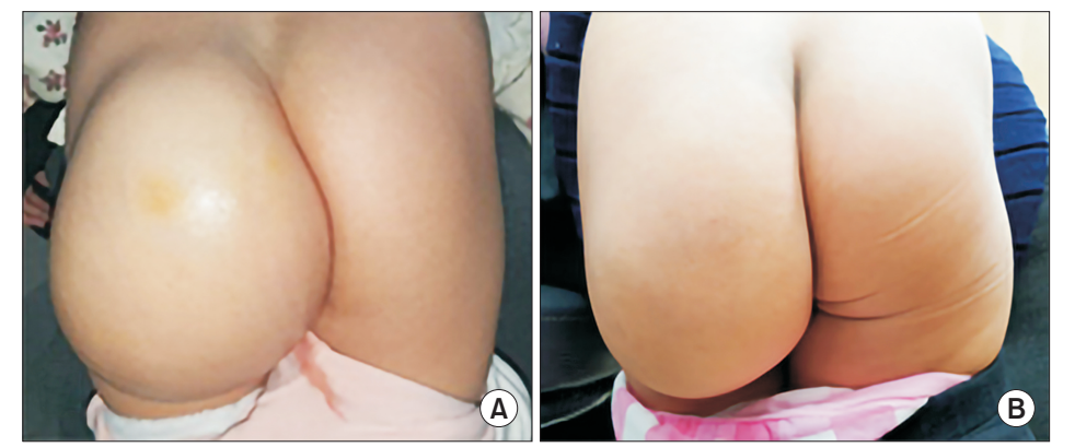
Fig. 2. Clinical photograph of a patient showing a buttock lymphatic malformation before the initiation of sirolimus (A) and interval decrease of in the size of the lesion (B).

Group A, complete response + significant/moderate of partial response; group B, modest of partial response + progressive disease.