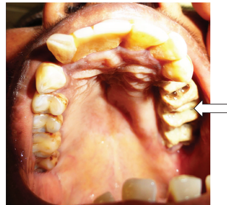
FIGURE 2: Intraoral examination reveals necrotic bone with pus discharge in relation to left maxilla (white arrow).

phagocytic ability with altered polymorphonuclear leukocyte response [7]. In diabetic patients Rhizopus arrhizus produce the enzyme ketoreductase, which allows them to utilize the patient's ketone bodies [8]. The increased risk of mucormycosis in patients with ketoacidosis may also be due to the release of iron bound to proteins [4].