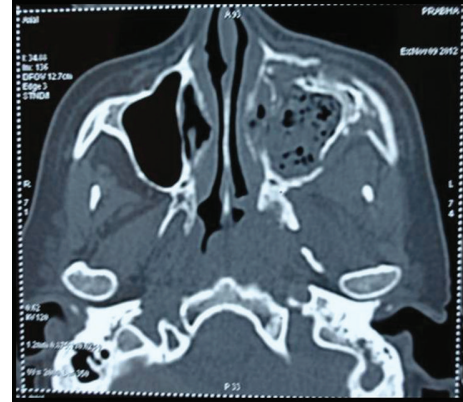
FIGURE 5: Axial view of CT showing destruction of posterior, medial, and anterior walls of left maxillary sinus.

Prognosis involves high morbidity and mortality and may improve with rapid diagnosis, early management, and reversible underlying risk factors [14]. Survival rates among groups of patients with invasive sinus disease without cerebral