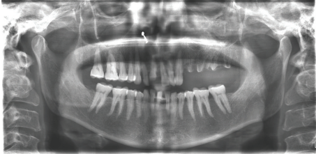
FIGURE 3: Orthopantomogram reveals missing teeth (24, 25, 26, 27, and 28) with unhealed sockets.