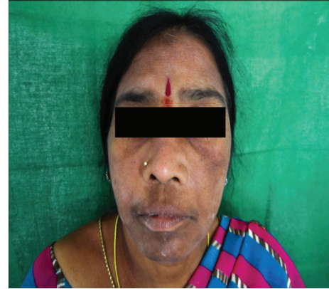
FIGURE 1: Extraoral examination reveals swelling in the left side of the face just below the eye.

Uncontrolled diabetes mellitus, because of ketoacidosis, can alter the normal immunologic response of patients to infections [7]. Such patients have decreased granulocyte