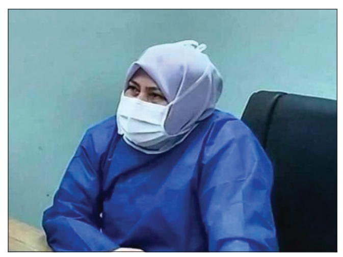
Figure 6: Dr. Shirin Rouhani from Iran

521,084 cases have been registered in the national healthcare system.