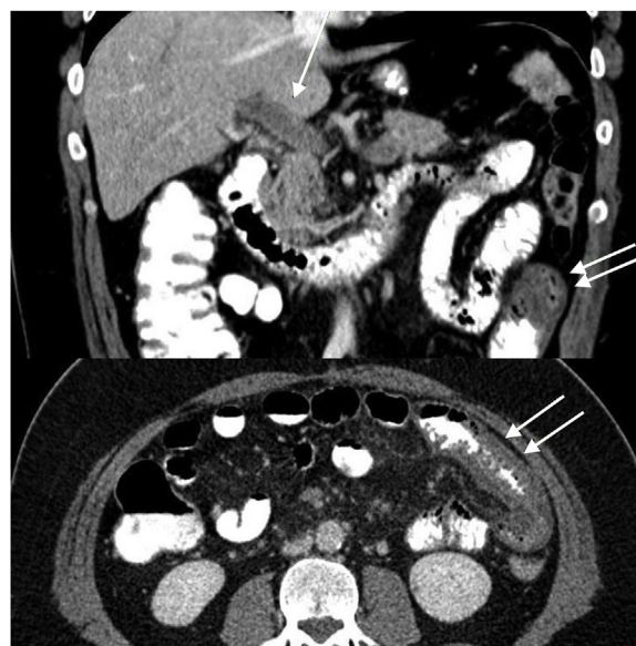
Fig. 1. Coronal and axial abdominal computerized tomography section. Single arrow: Thrombus in portal vein, Double arrow: small bowel wall thickening area.

The development of PMVT is a rare but fatal complication in patients after LSG. Some basic factors may be determinant for the development of PMVT. Some of these factors are; prothrombinogenic factors (Factor V Leiden mutation, Protein C, S resistance, thrombophilia, using oral contraceptive), elevated intraabdominal