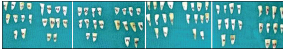
Figure 4: 80 teeth divided into 4 groups