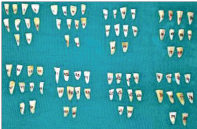
Figure 3: 80 teeth samples