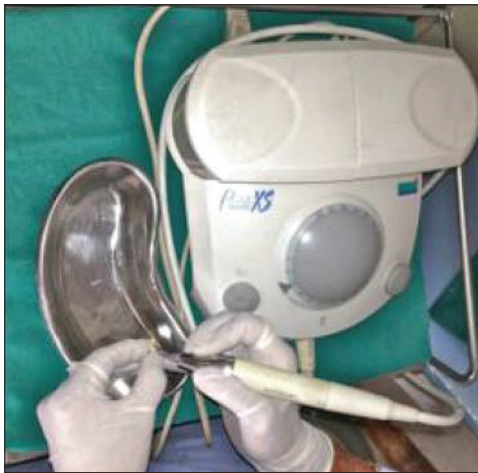
Figure 2: Cleaning of tooth samples with ultrasonic scalers