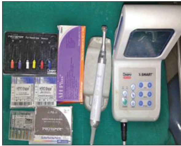
Figure 1: Armamentarium