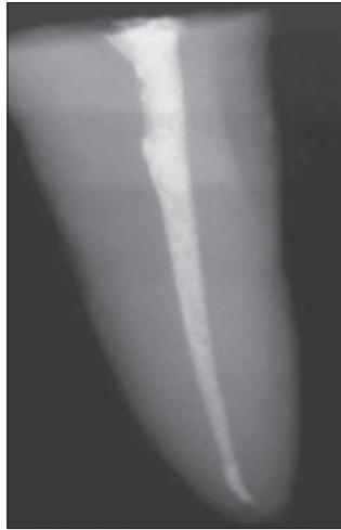
Figure 5: Dental radiograph of obturated teeth