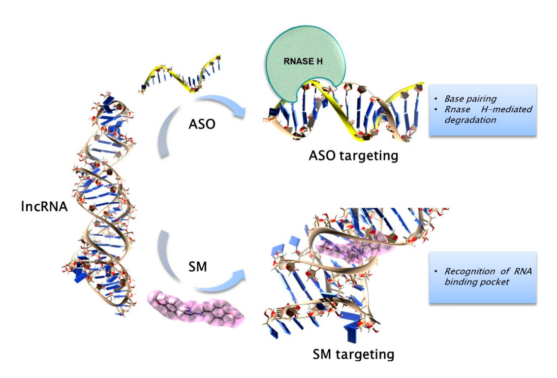
Figure 2. Strategies for lncRNA targeting. The picture reports, as a representative model, the triple helix region of the lncRNA MALAT1, which can be targeted or by LNA gapmeR ASO, that binds the lncRNA by perfect complementarity and triggers the RNAse H-mediated degradation (upper part), or by an SM designed to specifically recognize an RNA binding pocket (bottom part).