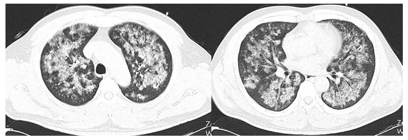
Figure 1. Typical image features at 4 hours after exposure time. Pulmonary edema could be observed on the computed tomography (CT) scan. Thoracic CT disclosed bilateral peribronchovascular ground glass opacity, as well as diffuse interstitial infiltrating shadow.

composed of four volumes of 65% nitric acid. Mild throat irritation and dyspnea occurred 3.5 hours after exposure. Approximately 2 hours later, the severe dyspnea recurred. A noninvasive ventilator with breathing parameters (FiO<sub>2</sub> 50%; Pi, 14; Ps, 6) was provided 12 hours after exposure. However, the oxygenation was not maintained. Tracheal intubation was performed 24 hours after exposure. However, even when high-level ventilator support was administered, the respiratory function deteriorated rapidly. Thus, VV-ECMO was used in the intensive care unit. The pre-ECMO survival probability was calculated using respiratory ECMO. The APACHE II score was 30.