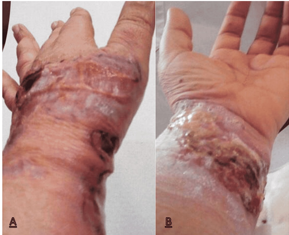
FIGURE 1: Painful necrotic ulcerated skin lesion on the left hand (A) and wrist (B)

Similar episodes with lesions scattered over the trunk and upper limbs on the previously intact skin surface followed, in a total of three recurrences in three years (Figure 2). The first two recurrent episodes were treated as the inaugural event. However, given the recurrence of lesions and their appearance, gradually, in more areas of the body, cyclosporine 200 mg per day was added, with a good response, and a slow weaning from therapy was performed. In the last episode, due to a difficult arterial hypertension control, cyclosporine was replaced with dapsone (50 mg per day). The lesions completely healed in one month.