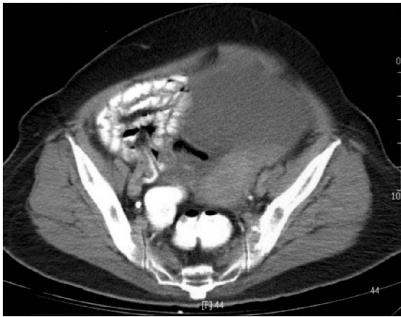
Figure 1 Abdominal computed tomography shows homogeneous cyst on the right side of the pelvis, which was larger than 35 mm in maximal diameter with a solid component.