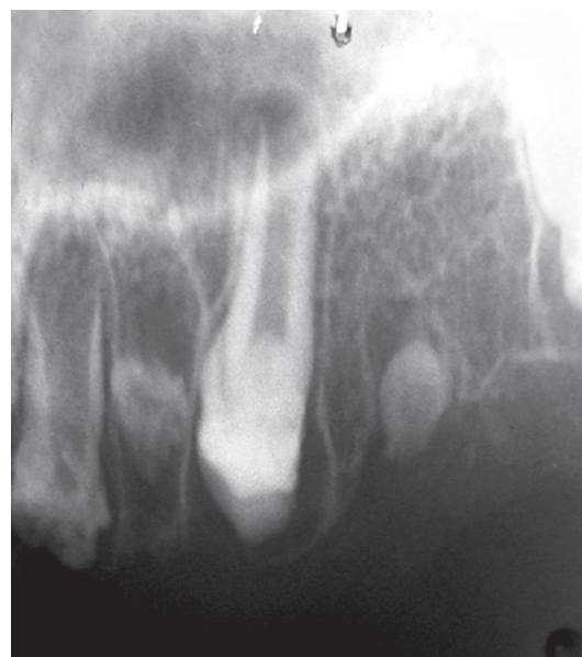
Fig. 4B: 12,13,15 and 16 showed ghost-like but 14 not affected as other