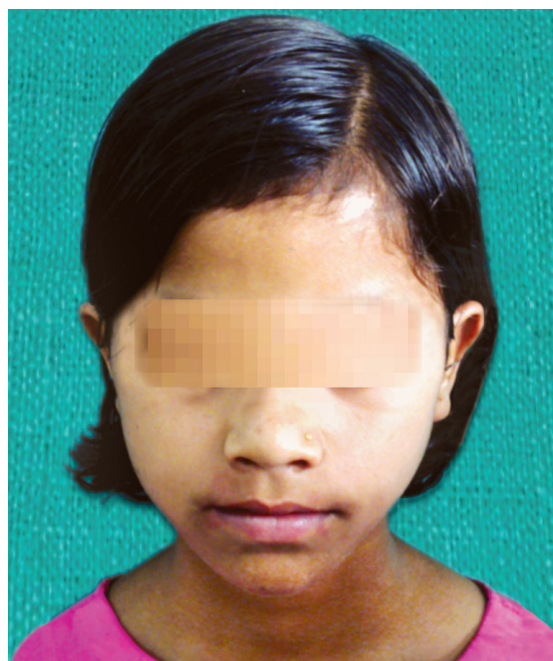
Fig. 1: No facial asymmetry

(Fig. 1). Intraoral examination revealed a full complement of dentition with normal occlusion except for the maxillary right quadrant. In right maxillary quadrant central incisor, lateral incisor, canine, first and second premolar, first and second molar were unerupted. The associated alveolar mucosa was slightly hyperplastic and covered by fibrous tissue. However, on left maxillary quadrant only central incisor was hypoplastic (Fig. 2). In the mandibular arch,