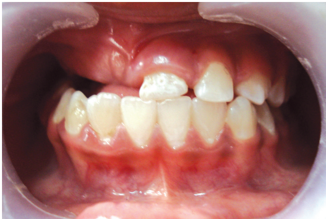
Fig. 2: Intraoral view

On the basis of the clinical and radiographic findings provisional diagnosis of regional odontodysplasia was made.