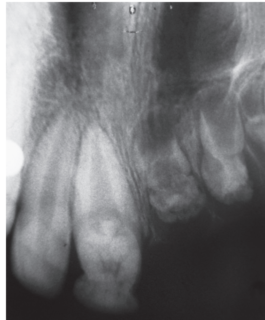
Fig. 4A: 11 and 12 showed ghost-like teeth and 21 showed wide pulp chamber with malformed crown