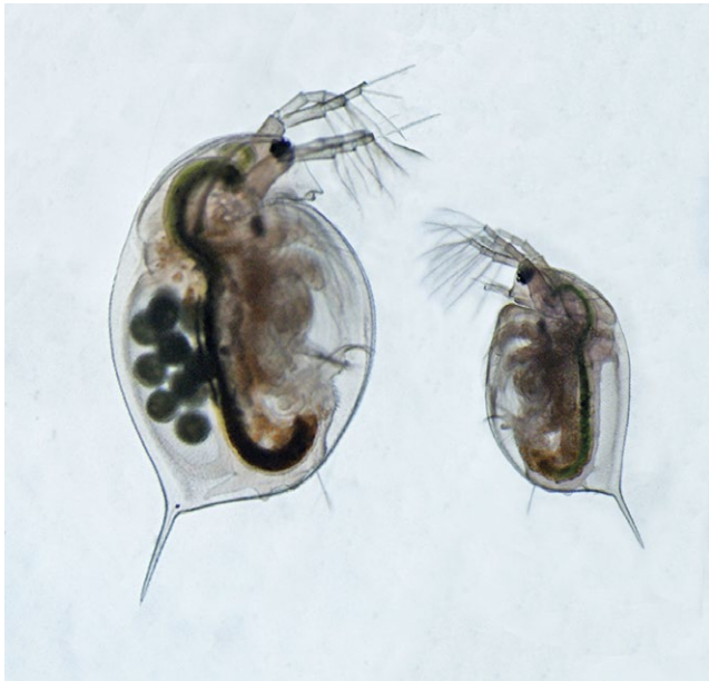
FIGURE 1 A female and a male of Daphnia magna

thus, increase the mortality rates of individuals of one sex only (e.g., Fedorka, Zuk, & Mousseau, 2004; Han, Jablonski, & Brooks, 2015; Sommer, 2000). Nevertheless, there are cases where reproduction at older ages contributes to overall fitness of one sex enough to promote its longevity. This may be related to body size where, for example, larger older females produce larger broods (Congdon et al., 2003), or to female mate choice where, for example, females prefer older males (Beck & Powell, 2000).