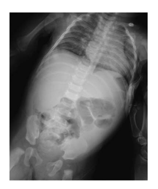
Fig. I. Plain abdominal film revealed increased opacity over the right upper abdomen, raising concern of hepatomegaly.

but no tumor size regression was seen. Exploratory laparotomy with partial hepatectomy was then performed and disclosed a large tumor mass arising from segment VI of the liver. Histopathology confirmed the diagnosis of hepatic leiomyosarcoma. After operation, adjuvant chemotherapy was given for 6 months and the patient has now been free from tumor for 4 years.