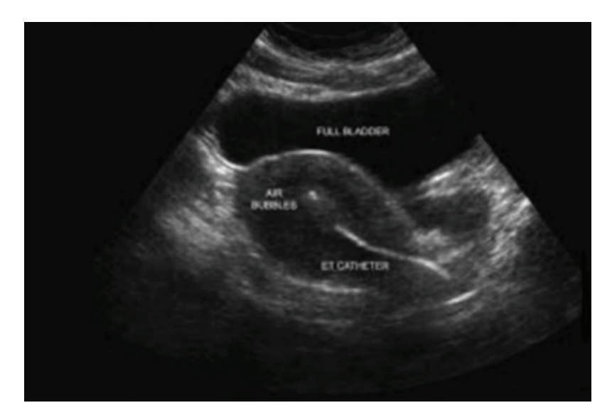
Figure 1. Transabdominal ultrasound viewing embryo transfer catheter and presence of air bubble at the fundus (19).

Chemical pregnancy was defined as the serum Beta HCG level > 25 IU/I within 14 days after the embryo transfer. In addition, clinical pregnancy was considered by detecting the fetal heart activity and determining the number of gestational sacs via transvaginal or abdominal ultrasonography within 2-3 wk after the confirmation of positive \beta -HCG. Abortion was described as the loss of pregnancy within 6-7 and < 20 wk, and ongoing pregnancy was defined as pregnancy proceeding beyond \geq 20 wk of gestation. In the present study, the implantation rate was defined as the number of identified gestational sacs in ultrasonography per the number of the transferred embryos. Both study groups were matched in terms of the outcomes, and luteal phase support was sustained until the 10<sup>th</sup> week of gestation.