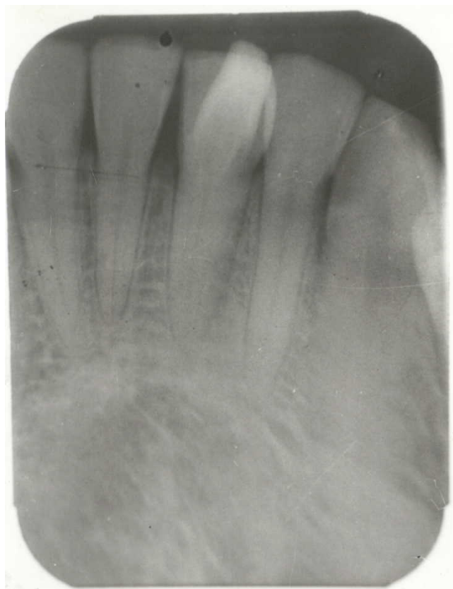
Figure 2 Peri-apical radiograph of the mandibular left central incisor showing the inverted V-shaped talon cusp.

A healthy looking 29 year old Nigerian male presented at the dental outpatient clinic of the Lagos University Teaching Hospital for the purpose of a dental check-up. It was his first visit to the dentist. He did not present any significant medical history. Oral examination showed a fair oral hygiene, no carious lesion, and all the permanent teeth were present. The mandibular left central incisor was displaced lingually with an accessory cusp on the facial aspect which had an attrition facet on the incisal edge. The cusp projected from the cemento – enamel junction and curved towards the incisal edge of the incisor (Figure 1). There was also attrition of the incisal half of the palatal aspect of the maxillary left central incisor. There was a negative family history of such dental anomaly from the patient and there was no associated systemic disorder. A periapical radiograph revealed an inverted V-shaped radiopaque structure on the mandibular left central incisor (Figure 2). The extent of pulp tissue into the cusp could not be determined on the radiograph. A diagnosis of type 1 talon cusp was made. The condition and the planned periodic and gradual reduction of the cusp with topical fluoride application and Composite resin facing was explained to the patient. Orthodontic alignment of the displaced central incisor was also planned. With his consent, after oral prophylaxis, a minimal reduction of the