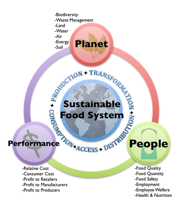
Figure 1 Components of a sustainable food system.

When considering the development of sustainable practices, the measurements are not as dichotomous as "sustainable" or "unsustainable." Typically, sustainability measurements are on a continuous scale, and practices are viewed as more or less sustainable, given the uncertainty of future challenges that may