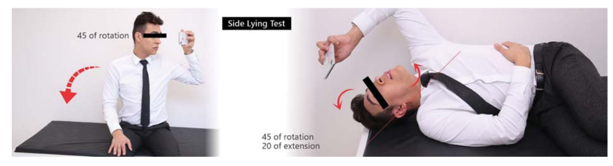
Fig. 4 Side Lying Test (adapted from the original).<sup>45</sup> The patient sits sideways in the middle of an examination couch. The subject turns his/her head 45° away from the test ear and lies sideways so that they maintain the 45° head turn looking upwards toward the ceiling while the nystagmus is recorded. Bring the patients feet up onto the couch to be more comfortable. An external support (i.e caregiver) is commonly required.

On the other hand, if the BLT is inconclusive, the examiner should perform other tests, such as the Dix-Hallpike test or side lying test and roll test to exclude the diagnosis of BPPV.