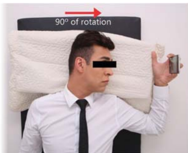
Fig. 3 Supine Roll Test (adapted from the original) procedure. The patient lies supine on an examination couch. The subject turns his head 90^{\circ} to either side, while the nystagmus is recorded. The head should be maintained for 45 to 60 seconds in each position. A slight elevation of the head from the table ( \sim 20^{\circ} ) (i.e head resting on the pillow), is recomended.<sup>38</sup>

to the nystagmus direction regarding the dependent ear. It can be geotrophic (beating to the ground) or apogeotrophic (beating to the ceiling).<sup>37–39</sup>