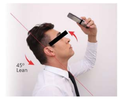
Fig. 2 Bow and Lean Test procedure – Left to right: Straight ahead, flexion and extension of the head while the eyes movements are recorded with a cellphone. Each position should be maintained for at least 30 seconds according to the tolerance of the patient (adapted from the original) 37